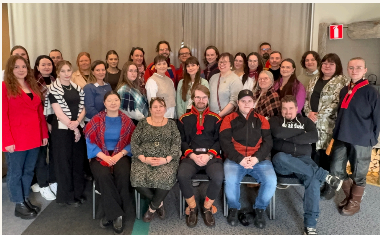
Group photo from the course for Sámi organisations on communication.

The project team has met twice in the period. 13.-16. January in Guovdageaidnu, and 8.-10. April in Heahtá. At both of the meetings it has been Lávdan Sámi Arena which has been the focus, and the team met with many local actors and collaborators for Lávdan Sámi Arena, like Sámi Allaskuvla and Beaivváš.