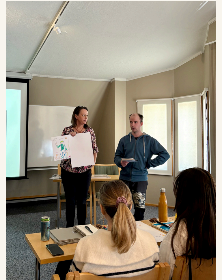
Participants from Ommu râast raaj - People Cross the Border showing the persona of their communication audiences..