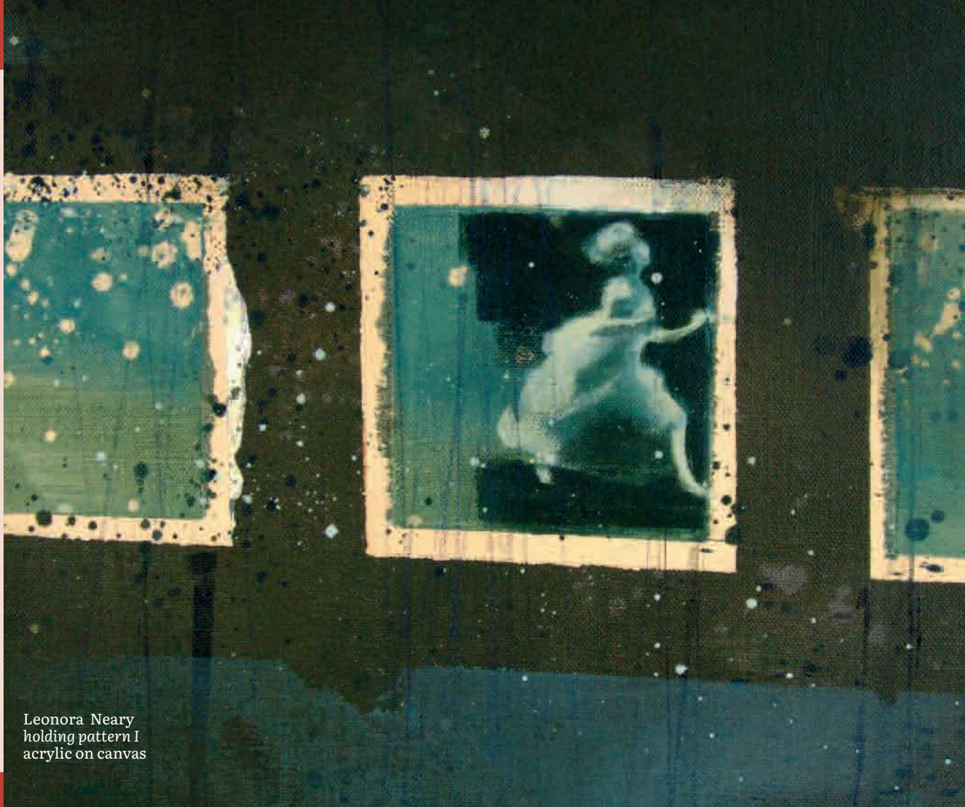
Leonora Neary holding pattern I acrylic on canvas