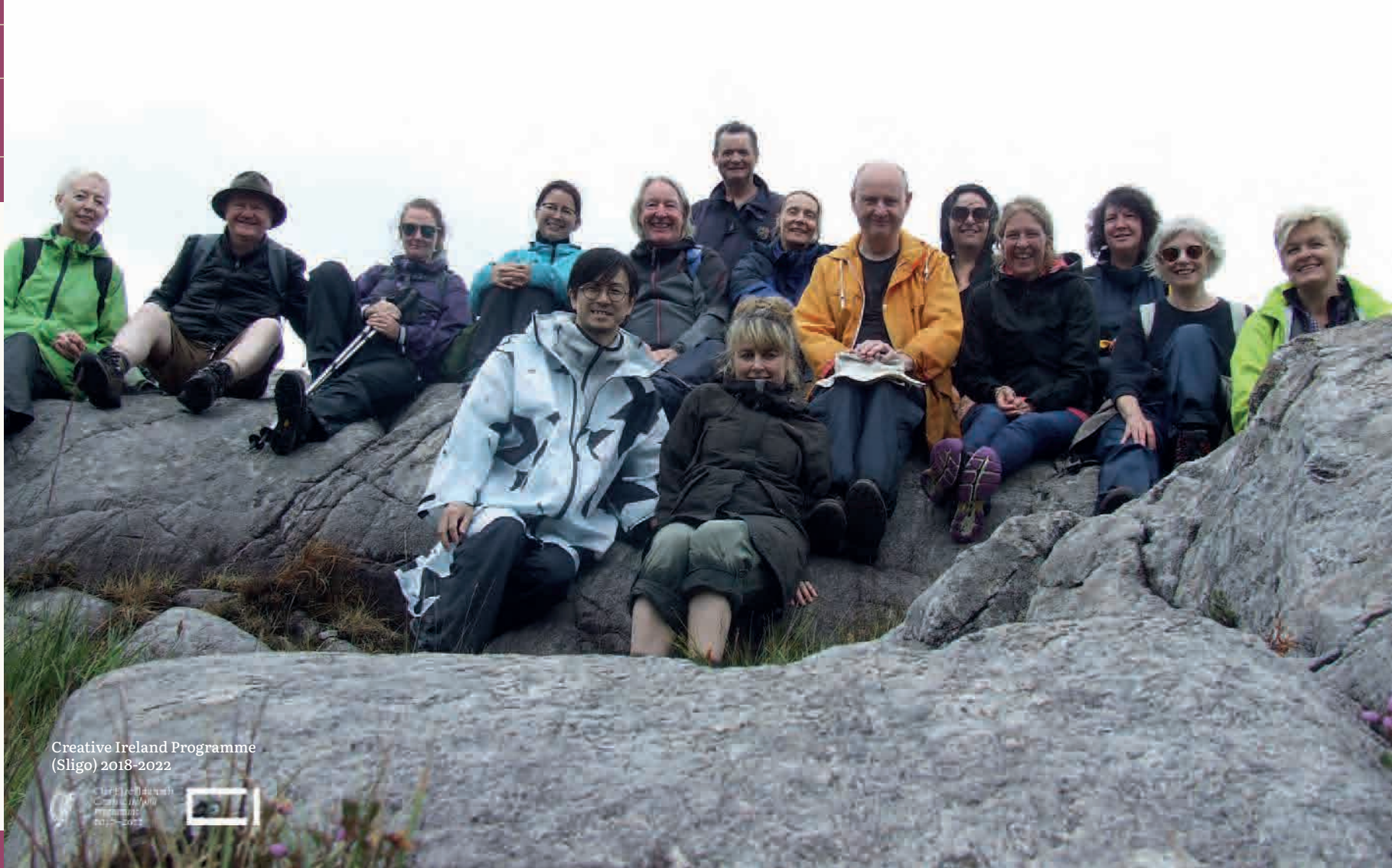
Creative Ireland Programme (Sligo) 2018-2022