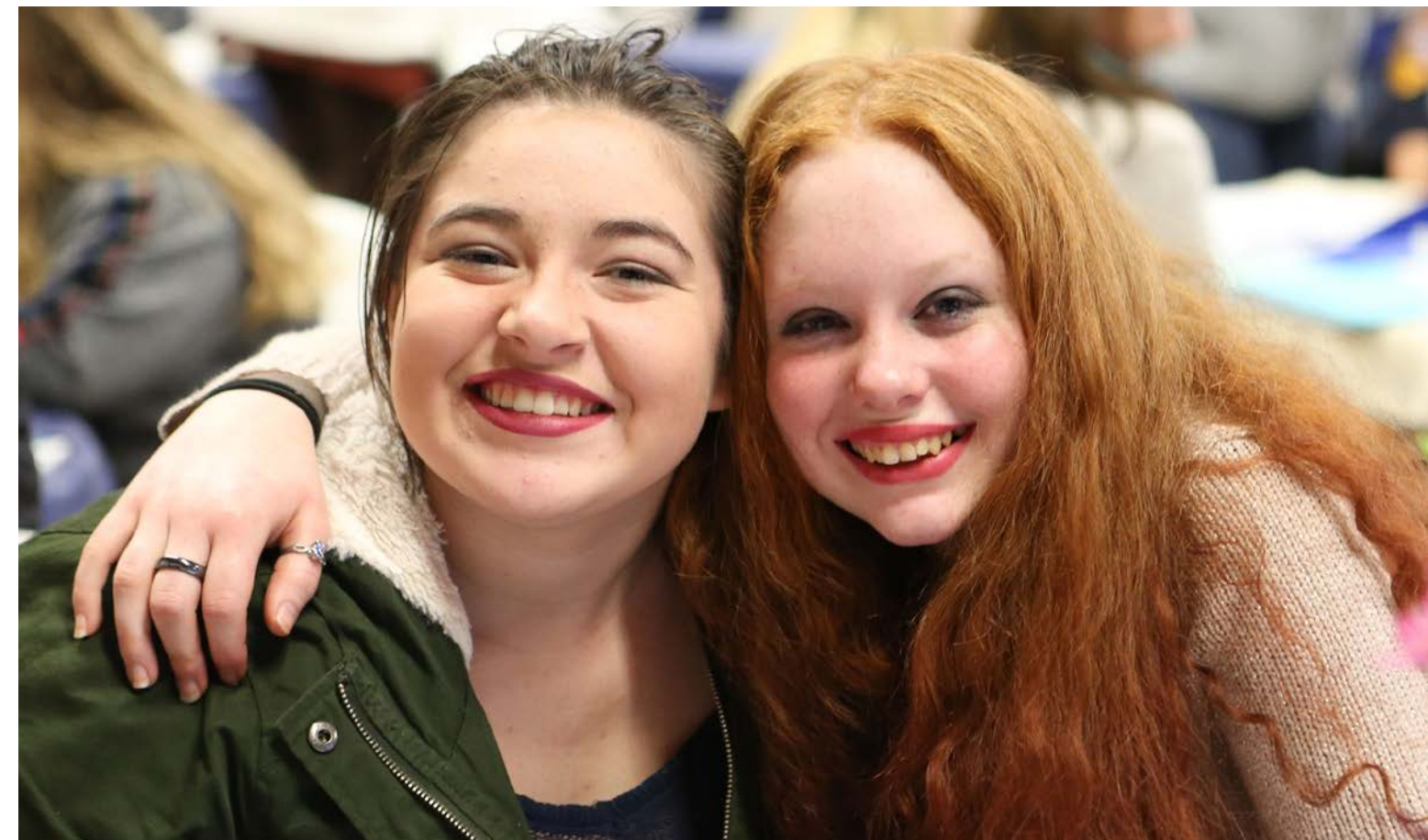
Dream It, Be It participants, USA

Our newest program, Dream It, Be It: Career Support for Girls ® , has provided more than 50,000 vulnerable girls in secondary school with the support they need to accomplish their career dreams. Support includes mentorship, goal-setting, tools to overcome setbacks, and career planning.