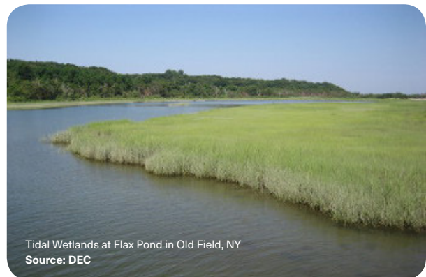
Tidal Wetlands at Flax Pond in Old Field, NY