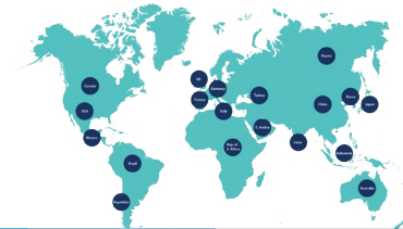
Table 1. G20 countries – public and private sector laws

Rating 1 Very / quite comprehensive 2 Somewhat / partially comprehensive 3 Absent / not at all comprehensive