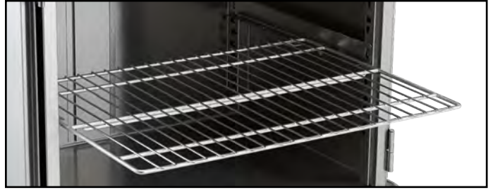
CCC2, 2E, 3, 4, and 5