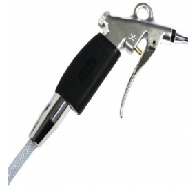
Cleaning Spray Gun