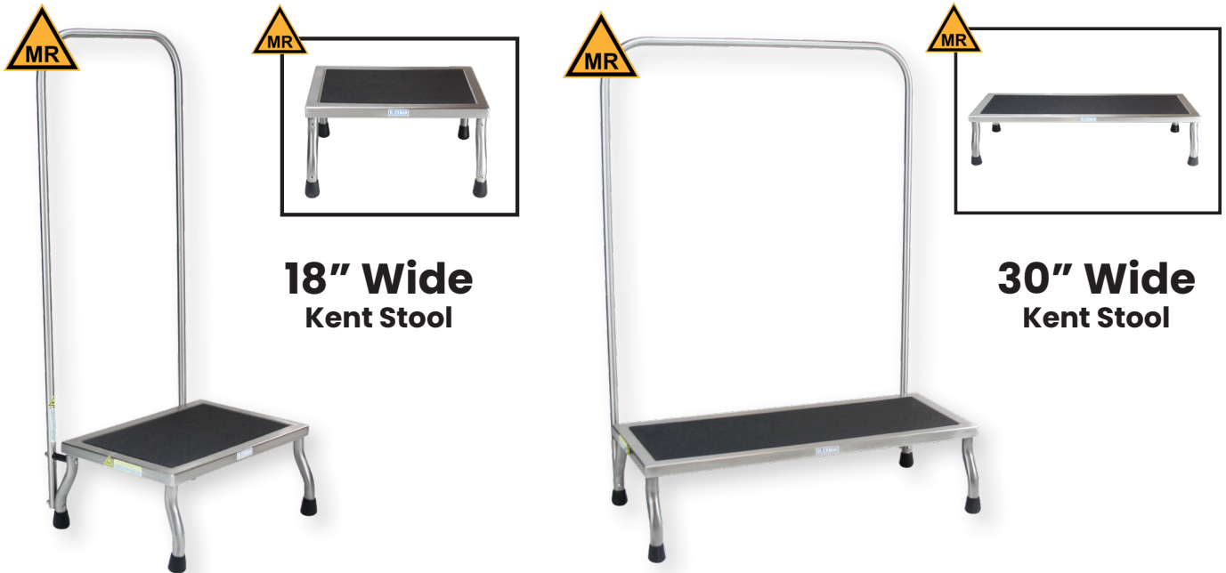
18" Wide Kent Stool

Width: 18" or 30" x Height: 8" x Depth: 12"