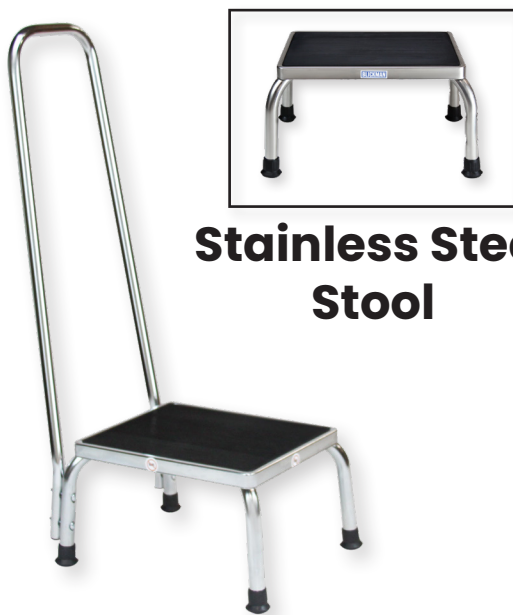
Stainless Steel Stool

Width: 14 1/4" x Height: 9" x Depth: 11 3/8"