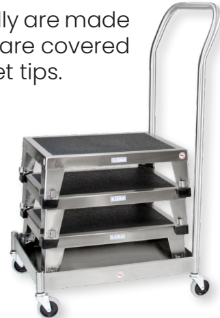
Dolly Dimensions: 21 1/2" x 39" x 16 1/2"