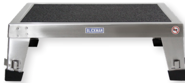
EZ Stool Dimensions: 18 7/8" x 6 1/4" x 13 7/8"

Description: Our EZ stacking stools and dolly are made with our durable stainless steel. The stools are covered with a non-slip rubber tread and feet tips.