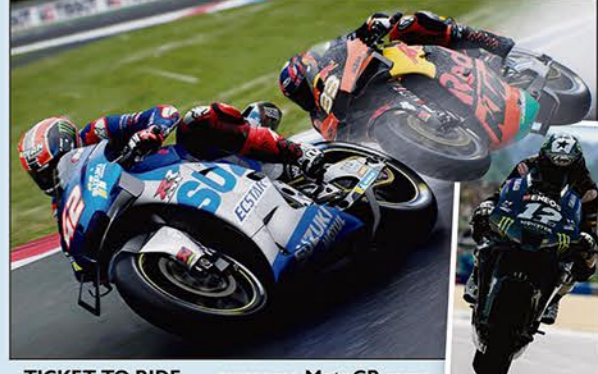
TICKET TO RIDE... awesome MotoGP game

To be in with a chance of winning, simply answer the following question: Who won MOTOGP 2020? HOW TO ENTER: Email your answer, name, address and