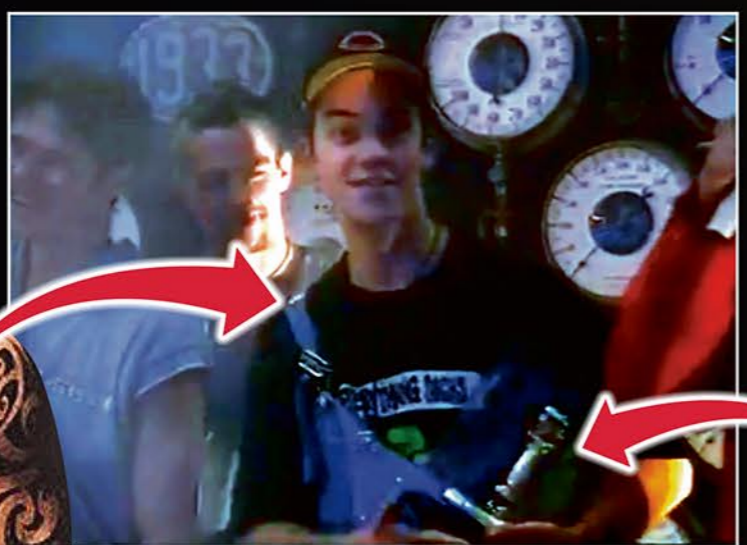
NAKED AMBITION... pop legend Robbie won a coveted Golden Joystick