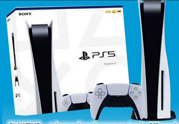
PLAY TIME... enjoy your favourite games on stunning PS5 console