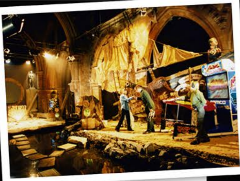
SHOWTIME... programme was huge hit