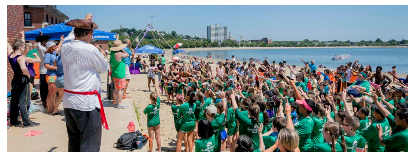
Successful beach programs advocated by the Commission have been a highlight of recent summer seasons. Sustaining and reinforcing these signature successful programs will continue to give thousands of kids and families the experience of a lifetime and leverage millions of dollars more in community investment.