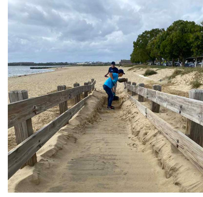
Clearing ramps regularly is an essential step to improve beach and water access for people with disabilities. Today, this practice is the exception, not the rule.