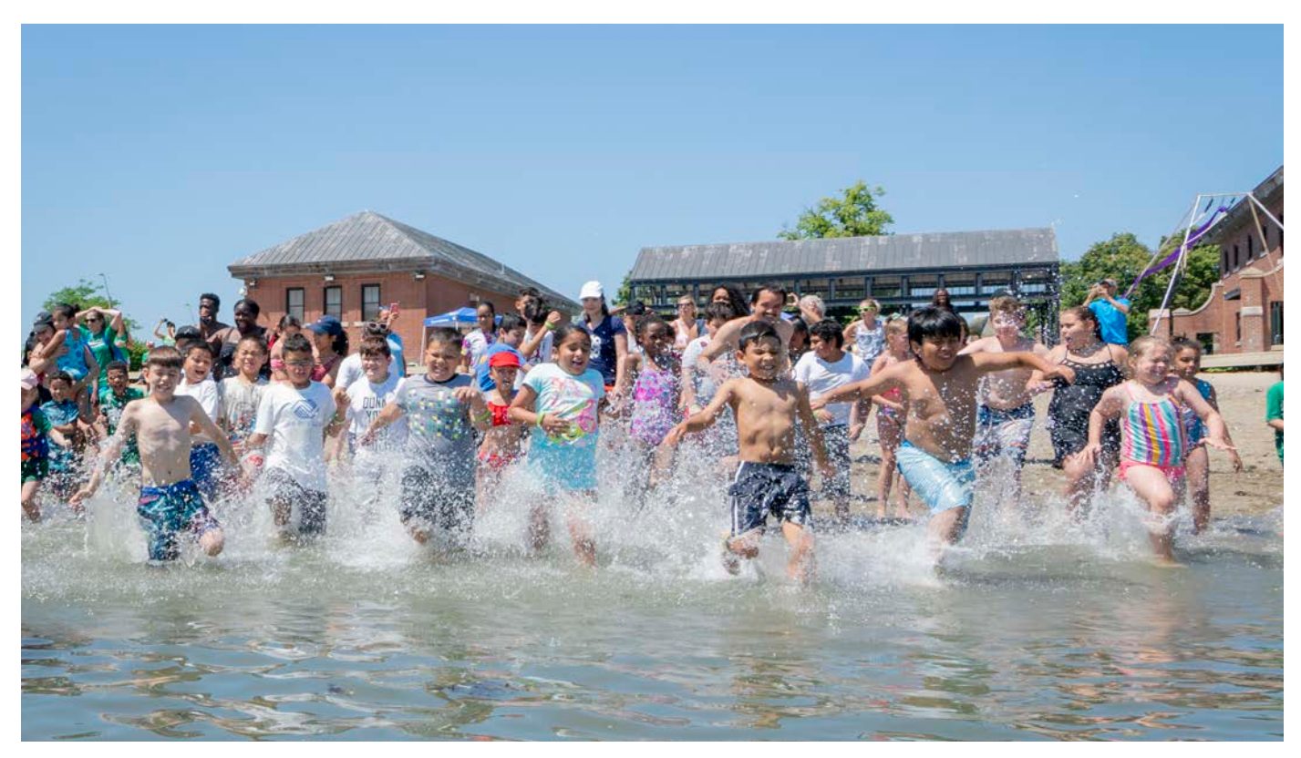
Working together, the Metropolitan Beaches Commission believes we can shape a future where our public beaches are shared and enjoyed by everyone.

The Commission recommends that Save the Harbor/ Save the Bay and the Commission jointly host workshops in Boston, Quincy and Lynn to help the Metropolitan Region's beachfront communities plan for sea-level rise and increasingly severe coastal storms.