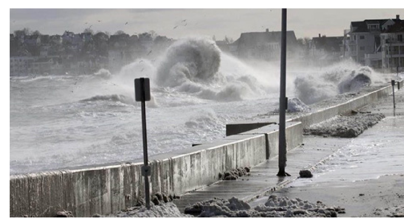
Sea level rise and more intense storms threaten both public safety and beach access in all our beachfront communities.

Sea level rise and climate impacts associated with global warming threaten both public safety and beach access in Lynn and Nahant, Revere, Winthrop, East Boston, South Boston, Dorchester, Quincy and Hull.