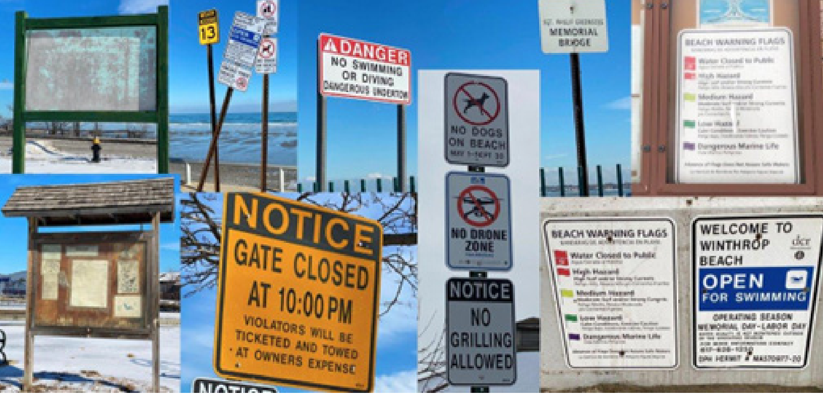
In 2022, Save the Harbor conducted a survey of signage on the metropolitan region's public beaches. Just four of the signs they found on the beach were in languages other than English.

As an important first step, in May 2022, DCR designed and posted several new beach safety signs with QR codes for multiple language translation on the region's public beaches. The Commission looks forward to working with the new DCR Commissioner to develop additional multi-lingual signs as appropriate in 2023.