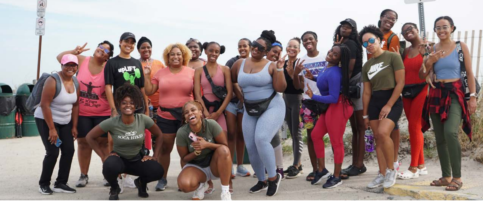
Free and frequent public programming reinforces connections to the beach for people of color and others who have been historically excluded from fair access to these shared spaces.

disabilities, and people who do not speak English as their primary language.