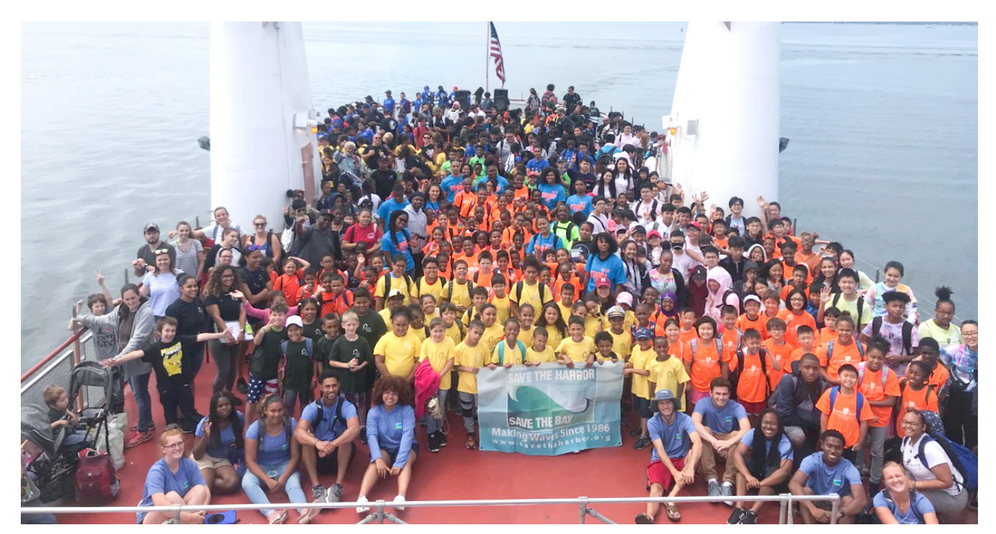
Tens of thousands of kids and families from over 100 Massachusetts communities rely on free access to "the People's Harbor" for health, relaxation and recreation every year.

Following our first public hearing, the Commission took immediate steps to increase diversity of representation within the Commission itself. The Commission also expanded its outreach efforts to people of color, people with