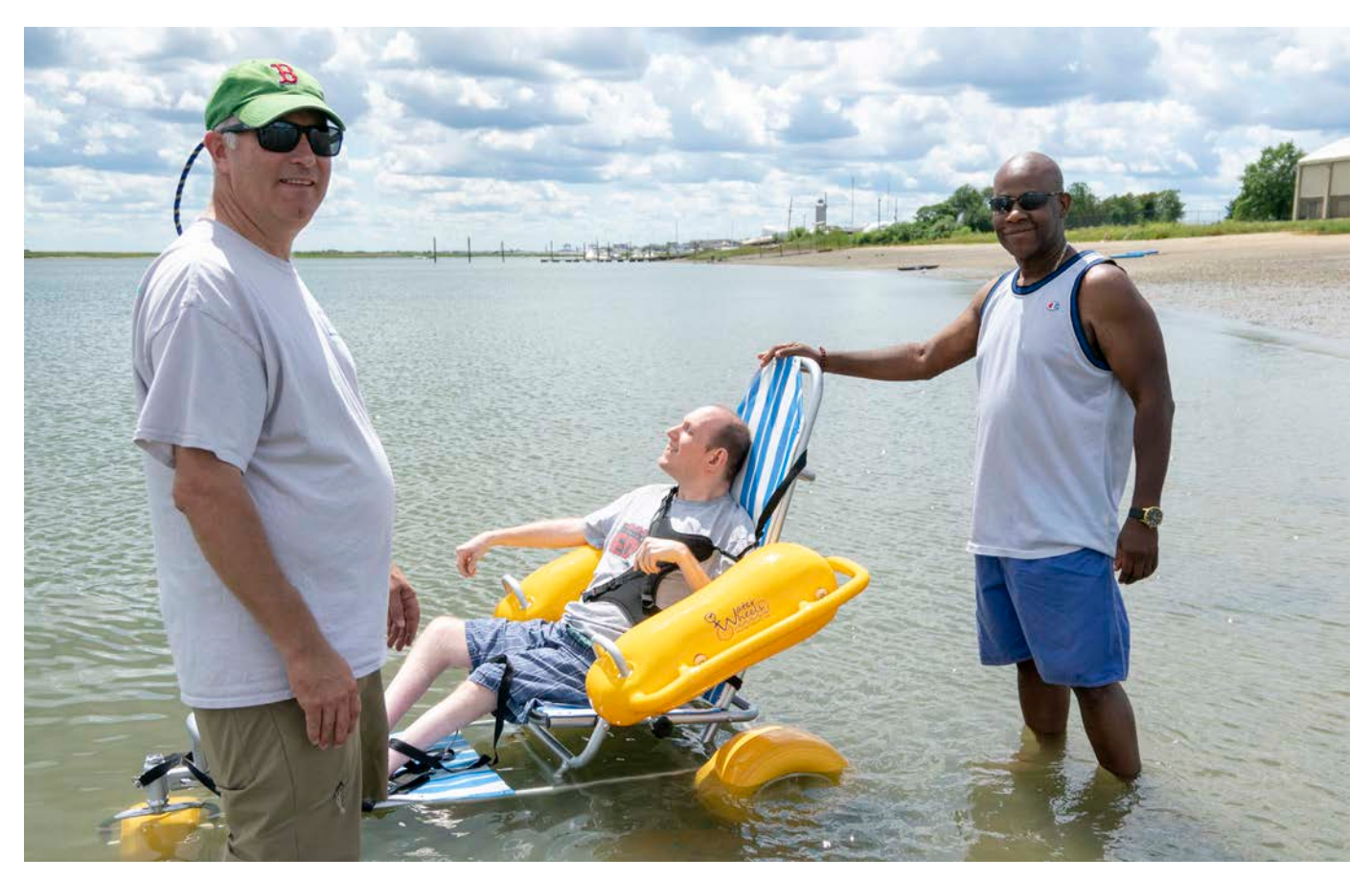
Providing mobility mats and wheelchairs at every beach is key to allowing people to become full participants rather than spectators on the region's public beaches.