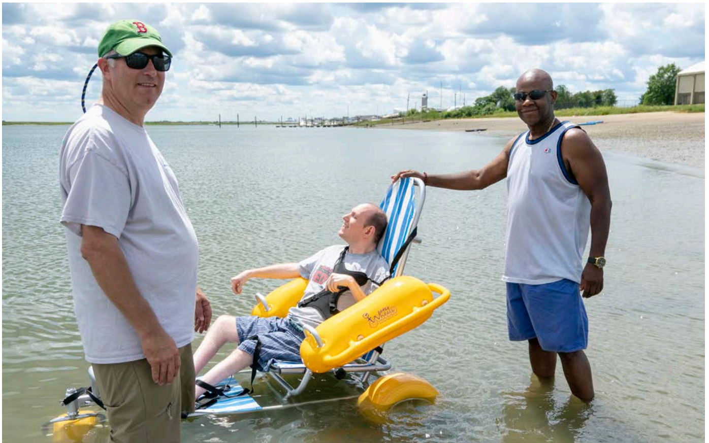
Providing mobility mats and wheelchairs at every beach is key to allowing people to become full participants rather than spectators on the region's public beaches.