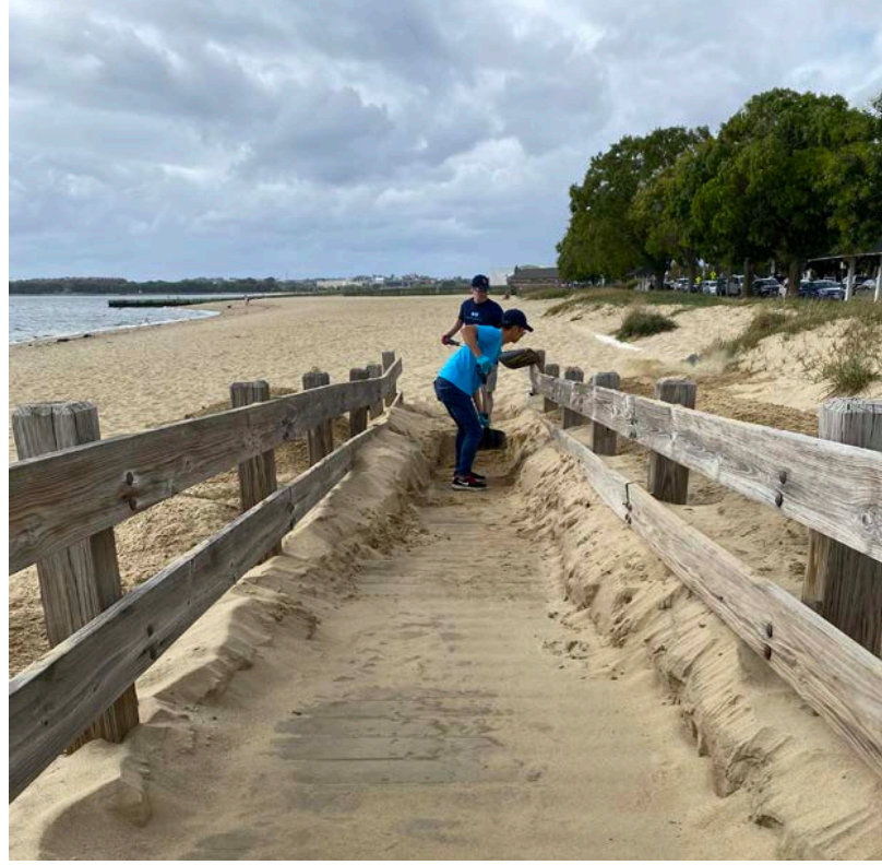
Clearing ramps regularly is an essential step to improve beach and water access for people with disabilities. Today, this practice is the exception, not the rule.