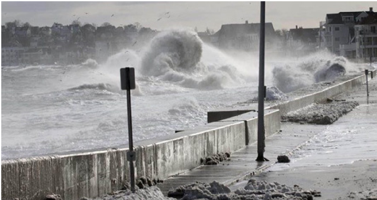
Sea level rise and more intense storms threaten both public safety and beach access in all our beachfront communities.

Sea level rise and climate impacts associated with global warming threaten both public safety and beach access in Lynn and Nahant, Revere, Winthrop, East Boston, South Boston, Dorchester, Quincy and Hull.