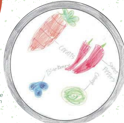
Farm to Heart affects the whole family. We asked the children in participating families to draw their favorite F2H foods. The dinner plate drawings are a few of their responses.

The Farm to Heart Initiative is a partnership between April Joy Farm and the Family Community Resource Centers (FCRCs) of Lincoln and Fruit Valley Elementary Schools.