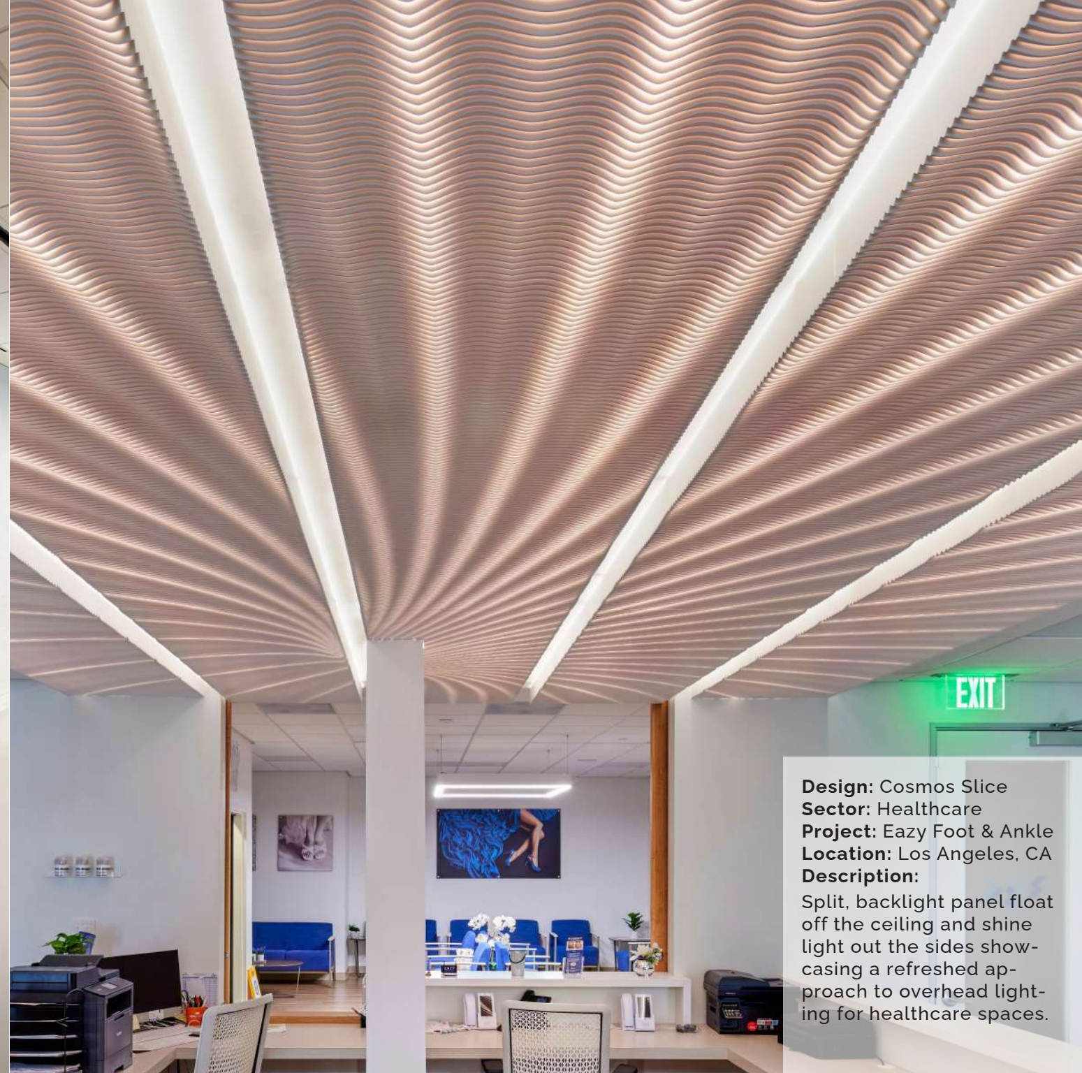
Design: Cosmos Slice Sector: Healthcare Project: Eazy Foot & Ankle Location: Los Angeles, CA Description: Split, backlight panel float off the ceiling and shine light out the sides showcasing a refreshed approach to overhead lighting for healthcare spaces.