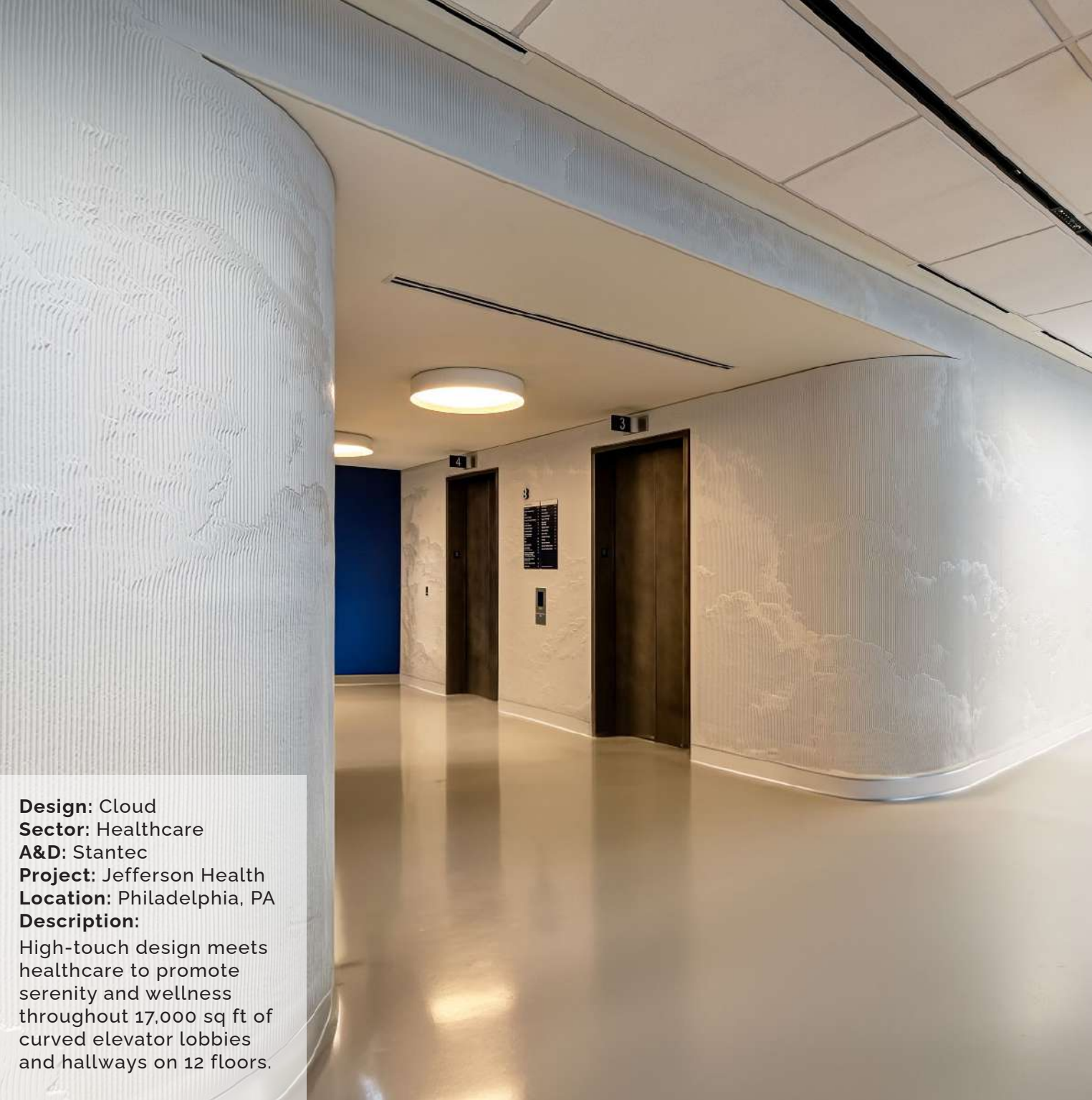
Design: Cloud Sector: Healthcare A&D: Stantec Project: Jefferson Health Location: Philadelphia, PA Description: High-touch design meets healthcare to promote serenity and wellness throughout 17,000 sq ft of curved elevator lobbies and hallways on 12 floors.