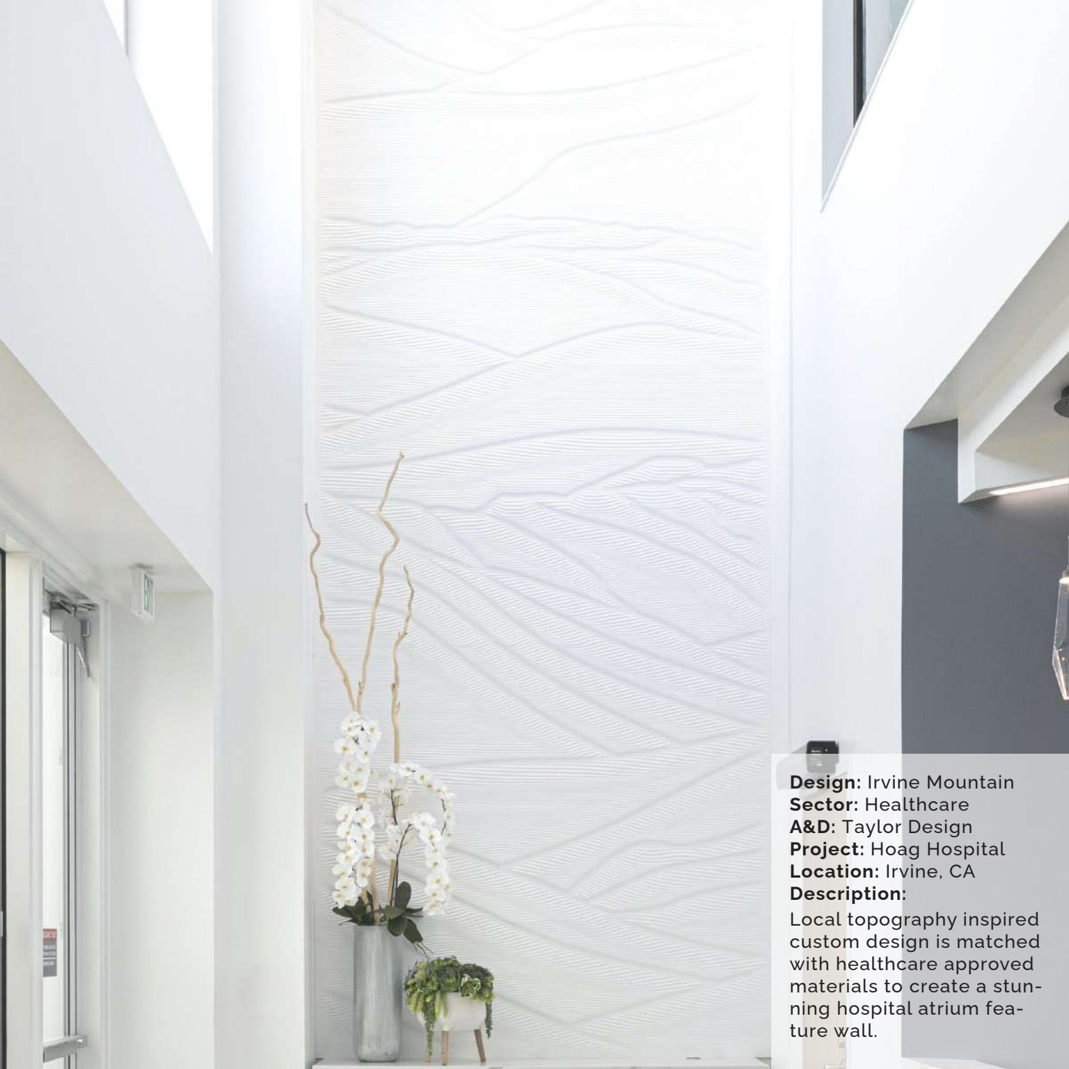
Design: Irvine Mountain Sector: Healthcare A&D: Taylor Design Project: Hoag Hospital Location: Irvine, CA Description: Local topography inspired custom design is matched with healthcare approved materials to create a stunning hospital atrium feature wall.