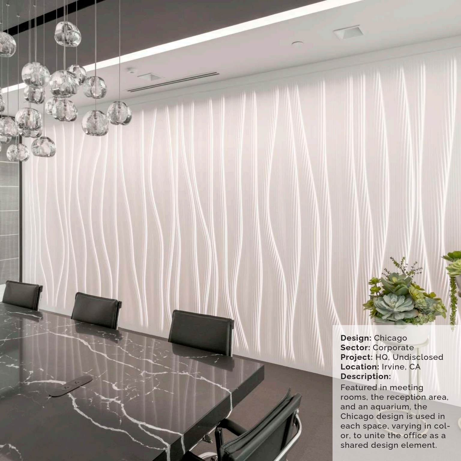
Design: Chicago Sector: Corporate Project: HQ, Undisclosed Location: Irvine, CA Description: Featured in meeting rooms, the reception area, and an aquarium, the Chicago design is used in each space, varying in color, to unite the office as a shared design element.