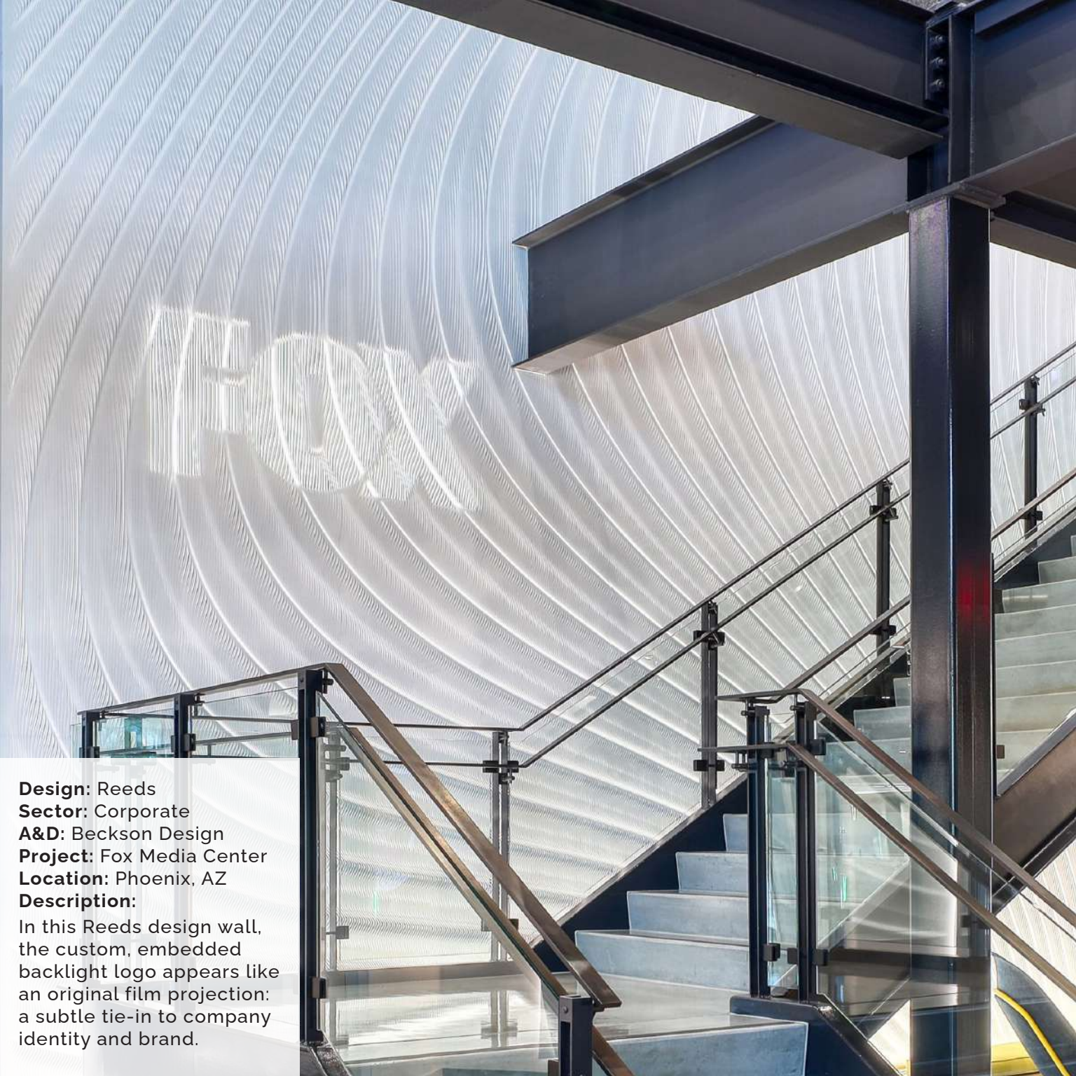
Design: Reeds Sector: Corporate A&D: Beckson Design Project: Fox Media Center Location: Phoenix, AZ Description: In this Reeds design wall, the custom, embedded backlight logo appears like an original film projection: a subtle tie-in to company identity and brand.