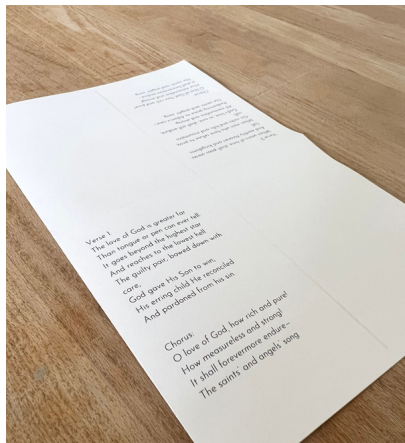
Fold paper in half widthwise.