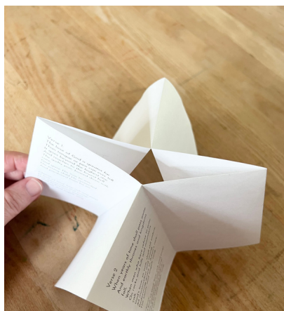
Turn the paper so you have 4 flaps.