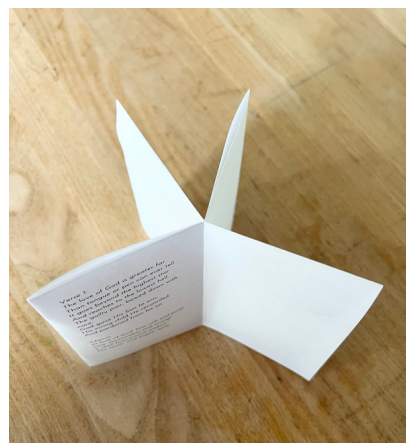
Now your paper looks like this.