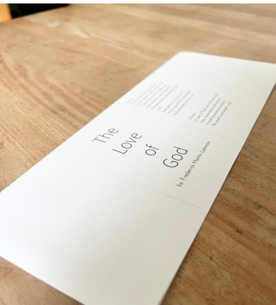
Fold paper in half lengthwise.