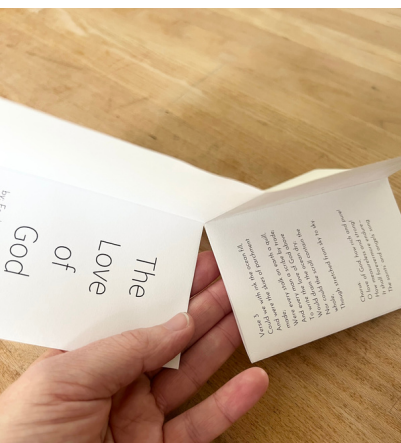
Now your paper looks like this.