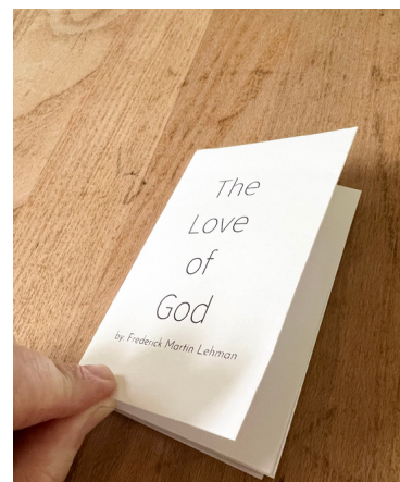
Color and illustrate your book!