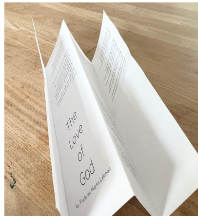
Fold edges of paper to the center.