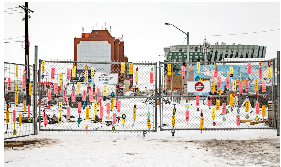
Above: Documentation of aiya哎呀's Harbin Gate events, aiya哎呀, 2018