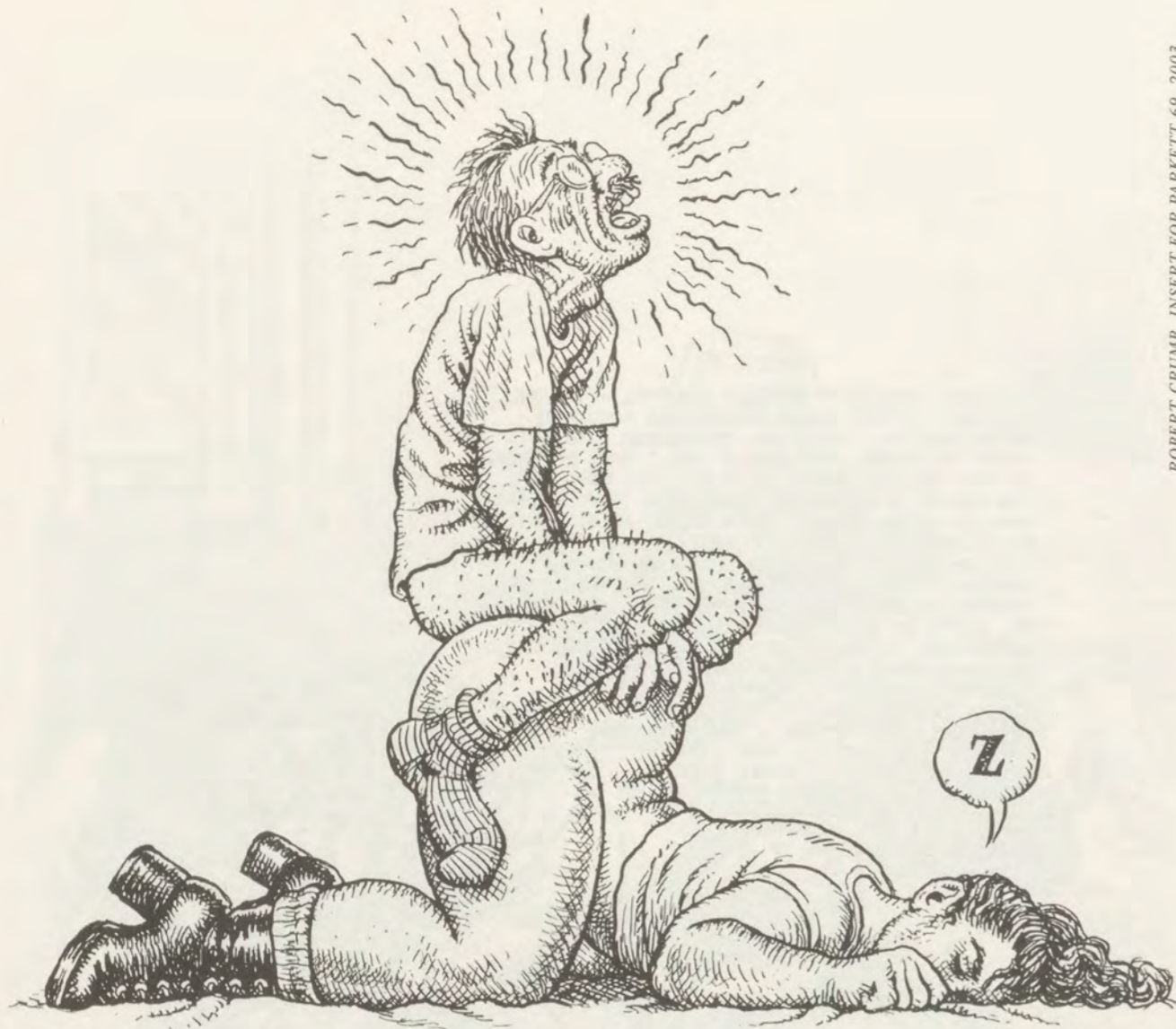
ROBERT CRUMB, INSERT FOR PARKETT 69, 2003.

SHE LIES STILL, HER HEAD ON THE MATTRESS, HER BUTT TOWERING HIGH IN THE AIR. I LOVE BEING UP THERE WITH MY DICK DEEP IN HER CUNT. SOMETIMES I BOUNCE UP AND DOWN, THRUSTING INTO HER ALL THE WAY TO THE HILT. OTHER TIMES I JUST SIT THERE IN A DIZZYING STATE OF SEXUAL EUPHORIA. I NOTICE THAT SHE HASN'T MOVED FOR A LONG TIME. I LOOK DOWN AT HER HEAD FAR BELOW AND REALIZE THAT THE DEAR BIG GIRL HAS DRIFTED OFF TO DREAMLAND! WELL, SHE HAD A BUSY DAY, THE SWEET THING, I CONFESS THAT IT EXCITES ME GREATLY TO BE FUCKING HER WHILE SHE'S ASLEEP. IT'S LIKE SHE'S GONE AWAY AND LEFT ME IN CHARGE OF HER FABULOUS STRONG GIRL BODY! NOW I CAN'T HOLD IT BACK ANY LONGER... THIS IS IT... I HAVE A BRAIN-POPPING ORGASM UP THERE. THEN I GET DOWN, CURL UP NEXT TO HER AND GO TO SLEEP..