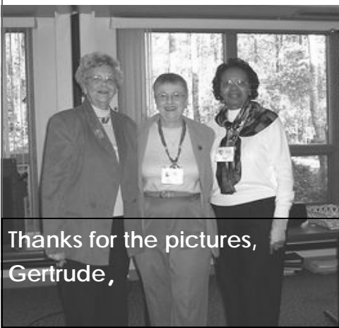
Thanks for the pictures, Gertrude,