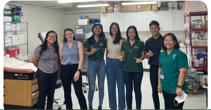
Kahua clinic volunteers

The Honolulu Emergency Services Department's Crisis Outreach Response and Engagement teams, better known as C.O.R.E., focus on a rapid response to Oahu's homeless population in partnership with the University of Hawai'i John A. Burns School of Medicine's Homeless Outreach Medical Education (H.O.M.E.).