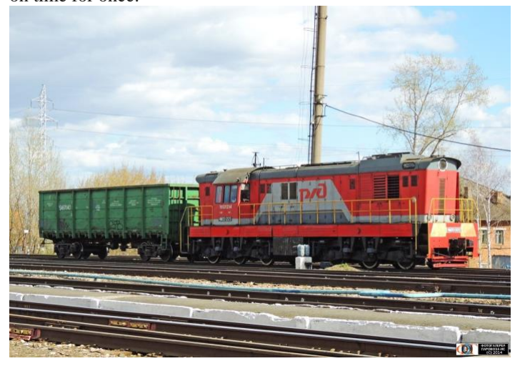
The switcher on the Posim station. Same type of locomotive at the same track where it was in my story at the end of crew lunch break.

they moved fast. Sometimes to save a couple of minutes for the conductor, I would run out from my office to take the track skates from the conductor and run with two skates in each arm back to the station building (each track skate weighs 7 kilos). Each day shift we sent the freight train from our station almost at the time limit of the work day for the train crew. And usually, I had to stay a half hour or whole hour to finish my paperwork. But one happy day we had not too much work, and I thought we would finish our shift smoothly and would send the freight train on time for once.