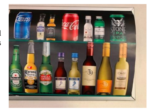
Menu boards from an Amtrak lounge café car

and exit vestibules. Between the foot traffic activity and the stairwell lights on all night, it did make getting a night's sleep a little more challenging.