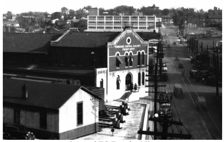
Original TC Freight Office

Tennessee Central Railroad's Nashville Freight Depot and Offices. 1902 – 1969