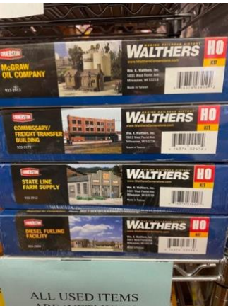
New HO items recently received include some nice structure kits from

Holiday Hours - The Hobby Shop will be open Thanksgiving weekend (Nov 27) but closed on Christmas Day and New Year's Day.