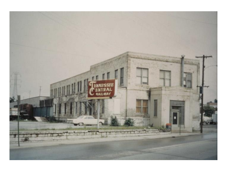
Replacement TC Freight Office Building – note the neon sign!

A fire in 1942 completely destroyed the offices in the freight depot. Soon after a replacement depot was built of a much simpler styling . The building was finally demolished in 1969.