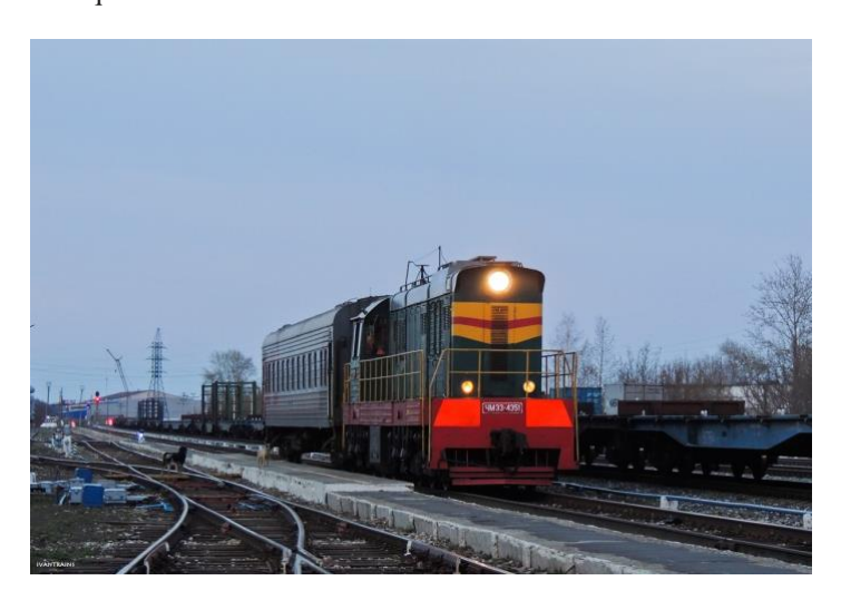
The commuter train on the Pozim station, same type of the engine, at the same track but in the opposite direction.

But the worst thing of all was that during that busy time I started to receive calls from different departments of headquarters about situation with the train.