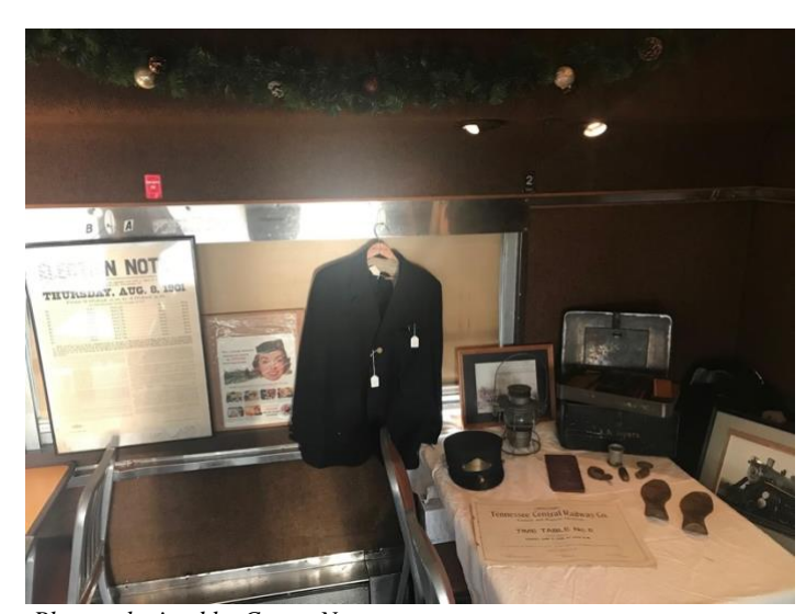
(Note you can expand the picture to better see the items, by using the + and - zoom capabilities at the top of your screen)

Lots going on this month in the library and archive, including some very exciting news coming for genealogy buffs and descendants of TC employees. I'll talk about that more in December, but this month I'll just take a moment to share what was out for display during the Nashville Steam Fall Open House for those who couldn't make it.