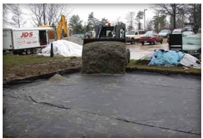
Figure 3. Application of the geotextile under aggregate base.

Typical 4 in. (100 mm) diameter perforated drainage pipes surrounded with minimum 3 in. (75 mm) of No. 57 or similar open-graded stone is wrapped in woven or non-woven geotextile as specified by the designer. The surface of the stone is even with the top of the compacted soil subgrade. The stone and geotextile pipe assembly is placed along the pavement perimeter to remove excess water in the subgrade soil and base. The perforated pipe should be sloped and directed to outlets at the sides or ends of the pavement. The pipe outlets should be covered with screens to prevent animal ingress. Drain pipes are recommended in clay soils or other slow draining soils subject to vehicular