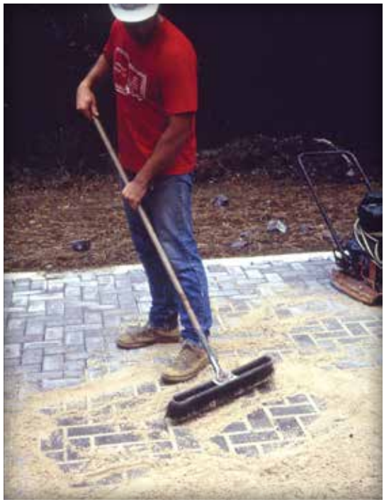
Figure 10. Spreading the joint sand.

sand. Masonry sand for mortar should never be used for bedding, nor should limestone screenings or stone dust. The bedding sand should have symmetrical particles, generally sharp, washed, with no foreign material. Waste screenings and stone dust should not be used, as they often do not compact uniformly and can inhibit lateral drainage of moisture in the bedding layer. ICPI Tech Spec 17—Bedding Sand Selection for Interlocking Concrete Pavements in Vehicular Applications provides additional guidance on selecting bedding sand and gradations including limits on material passing the No. 200 (0.075 mm) seive. See Table 5.