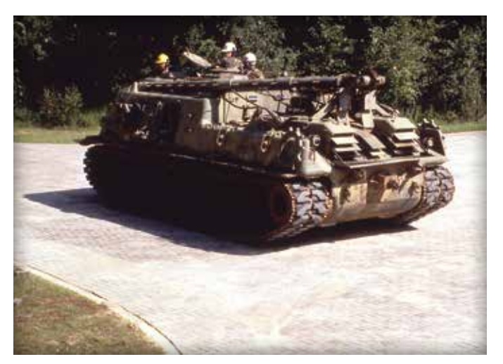
Figure 13. The completed paved area from Figure 12 receives tank traffic at the U.S. Army Proving Grounds in Aberdeen, Maryland.

ICPI Tech Spec 9–A Guide Specification for the Construction of Interlocking Concrete Pavement helps translate construction methods and procedures described here into a construction document. Tech Spec 9 provides a template for developing project-specific materials and installation specifications for