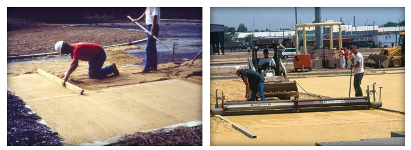
Figure 6a & 6b. Screeding the bedding sand.

Like compaction of the soil subgrade, adequate compaction of the base is critical to minimizing settlement of interlocking concrete pavements. See Figure 4. Special attention should be given to achieving compaction standards adjacent to edge restraints, catch basins and utility structures. When spread and compacted, the aggregate base should be at its optimum moisture. Bases for pedestrian areas and residential driveways should be compacted a minimum 98% of standard Proctor density. For vehicular areas, compaction should be at least 98% of modified Proctor density as determined by ASTM D1557, or AASHTO T180. While the highest percentage compaction (100%) is preferred, it may not be achievable on weak or saturated soils. Density measurements of the compacted base should be made with a nuclear density gauge or other methods approved by the local, state or provincial transportation department. See Figure 5. Unless otherwise specified, the compacted thickness of individual lifts should be +3/4 in. to -1/2 in. (+19) mm to -13 mm). Maintaining consistent lift thickness during compaction will help achieve consistent density. Variation in