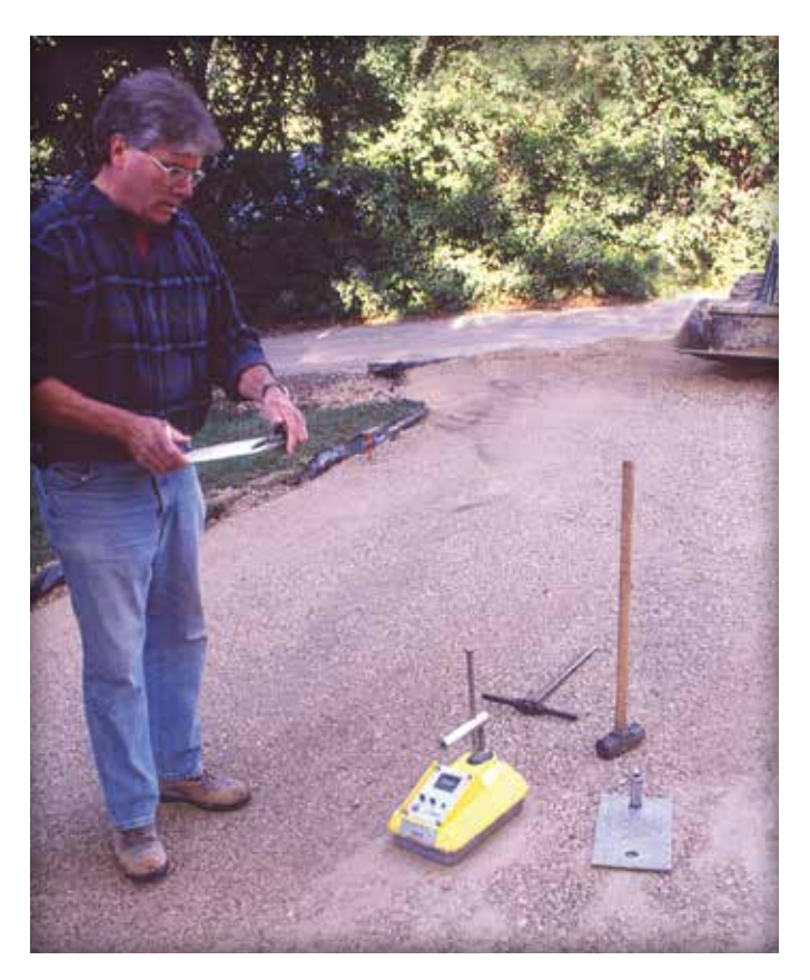
Figure 5. Density testing of the aggregate base with a nuclear density gauge.

Many localities determine base thickness with the 1993 Guide for the Design of Pavement Structures published by the American Association of State Highway and Transportation Officials (AASHTO). The AASHTO procedure calculates the structural number (SN) of the strength coefficients of each base and pavement layer. The SN is determined by assessing the traffic loads, soils, and environmental factors (e.g., drainage, freeze-thaw). The layer coefficient recommended for 3^{1/8} in. (80 mm) thick pavers on 1 in. (25 mm) bedding sand is 0.44 per inch (25 mm), i.e., the SN = 4^{1}/8 \times 0.44 = 1.82 . Base thicknesses can be readily determined by using the charts in ICPI Tech Spec 4–Structural Design of Interlocking Concrete Pavement for Roads and Parking Lots or ICPI Structural Design Software. This software is available for free download on www.icpi.org.