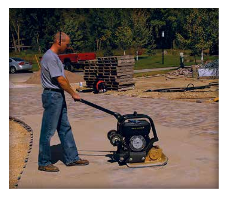
Figure 11. Vibrating sand into the joints.

screeded it should not be disturbed. Sufficient sand is placed and screeded to stay ahead of the placed pavers. Powered screeding machines that roll on rails and asphalt spreading machines adapted for screeding sand have been successfully used on larger installations to increase productivity.