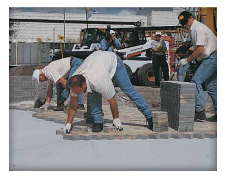
Figure 7. Placing the concrete pavers.

Edge restraints are a key part of interlocking concrete pavements. By providing lateral resistance to loads, they maintain continuity and interlock among the paving units. Aluminum, steel, plastic, or concrete are typical edge restraints. Consult ICPI Tech Spec 3 on edge restraints for recommendations on applications and construction.