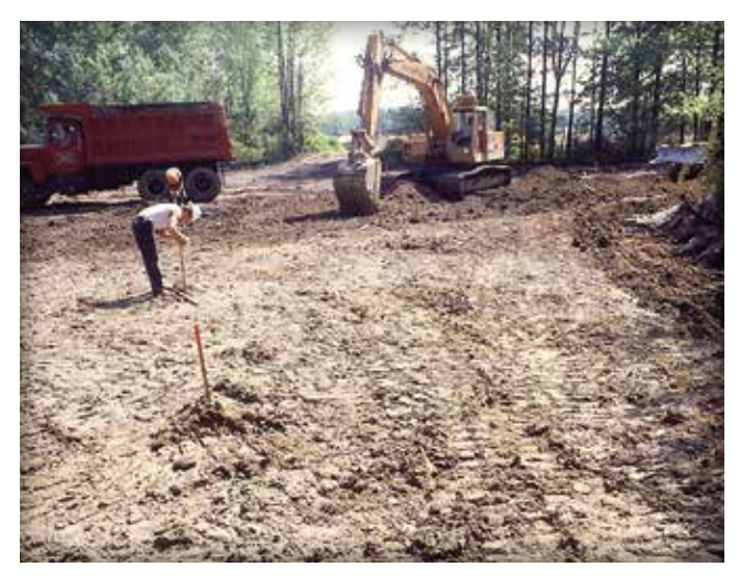
Figure 1. Excavation of the soil subgrade and placing grade stakes.

Prior to excavating, check with the local utility companies to ensure that digging does not damage underground pipes or wires. Many localities have one telephone number to call at least two days before excavation for marking utility line locations. Overhead clearances should be checked so that equip-