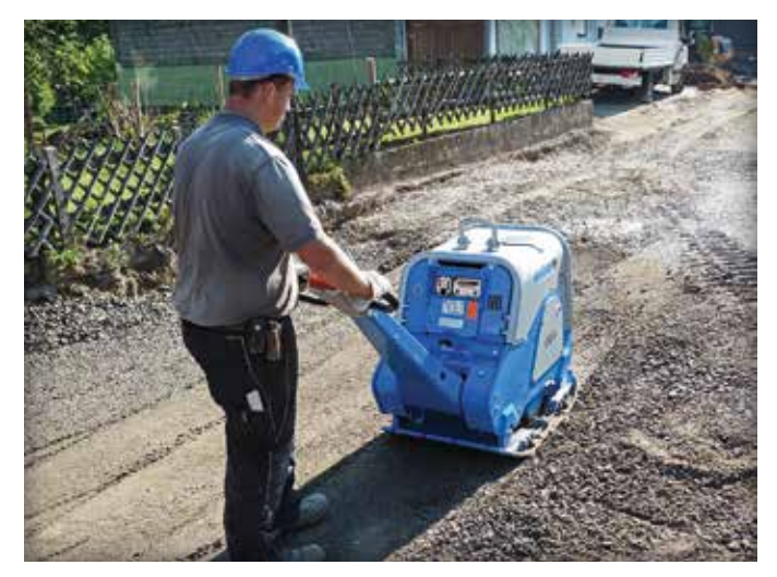
Figure 4. Base compaction with a reversible plate compactor.