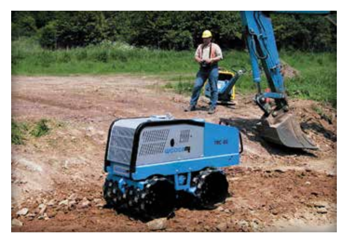
Figure 2. Compacting the soil subgrade.

ment does not interfere with wires. Site access by vehicles and equipment should be established so that the job can be built without delays.