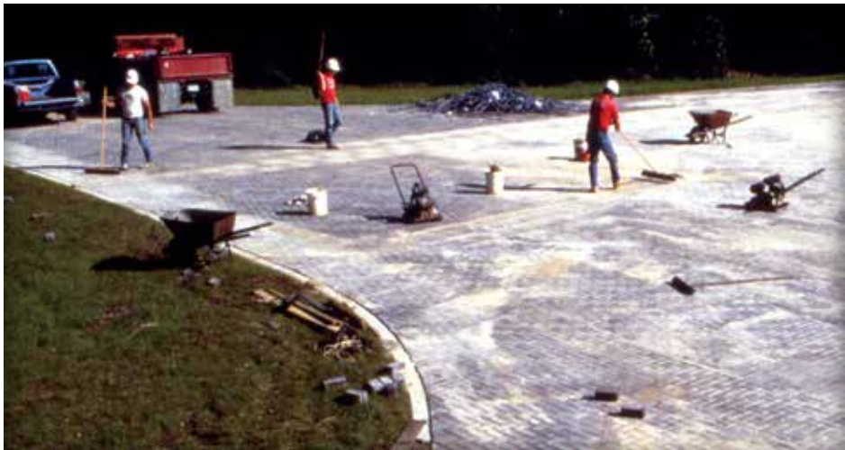
Figure 12. Removing excess sand from the finished surface will make the pavement ready for traffic.