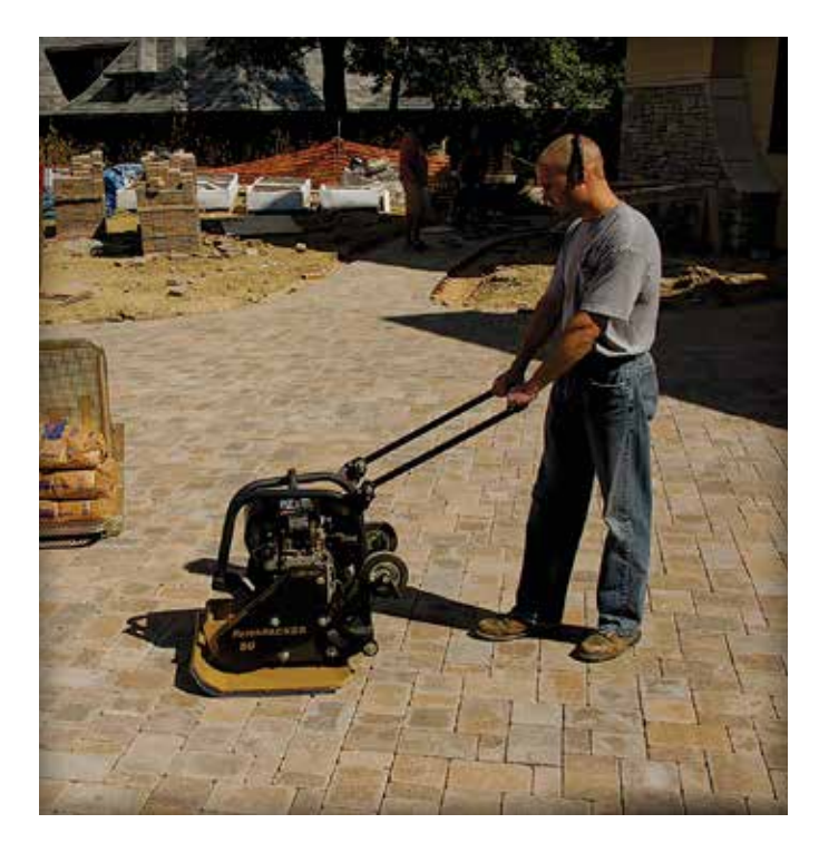
Figure 9. Compacting the pavers and bedding sand.

Edge restraints must be set at the correct level, especially if the tops of the restraints are used for screeding the bedding sand. Their elevations should be checked prior to placing the sand and pavers. A minimum of 1 in. (25 mm) vertical restraining surface should be in contact with the side of the paver to adequately restrain it. For heavy duty application a greater restraining surface may be warranted. Edge restraints are typically installed before the bedding sand and pavers are laid. However, some restraints can be secured into the base as the laying progresses.