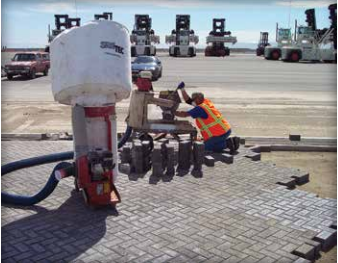
Figure 8. Saw cutting pavers.