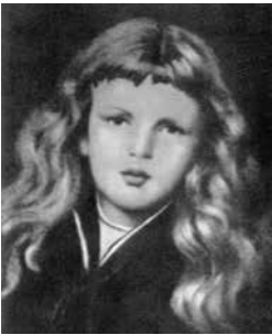
G.K. Chesterton at age 6.

'He thought it was given to him to judge the world and strike down the sinner. He would never have had such a thought if he had been kneeling with other men upon a floor. But he saw all men walking about like insects. He saw one especially strutting just below him, insolent and evident by a bright green hat — a poisonous insect.'