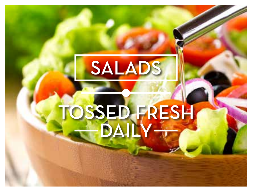
Served with pita bread & a cup of soup of the day

Tossed Caesar Salad Small $7.99 / Large $14.99