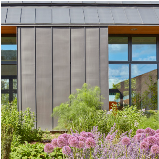
Above: Clore Learning Centre