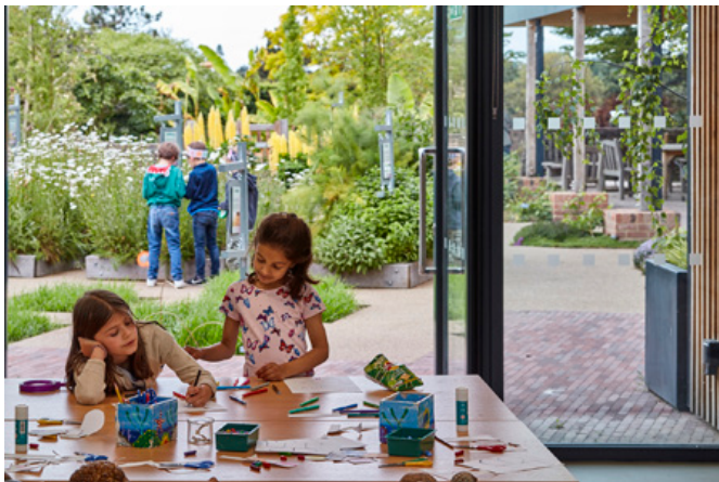
Above: Clore Learning Centre