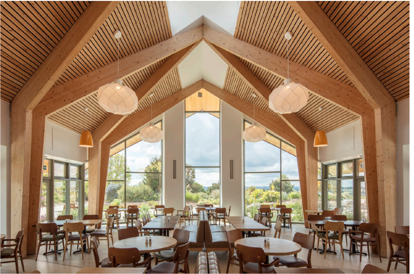
Above: Hilltop Lodge restaurant