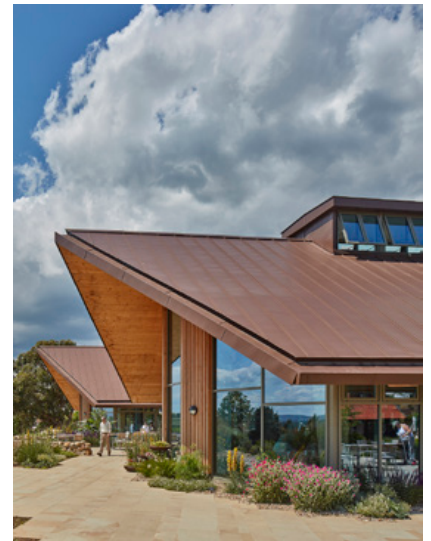
Above: Hilltop Lodge