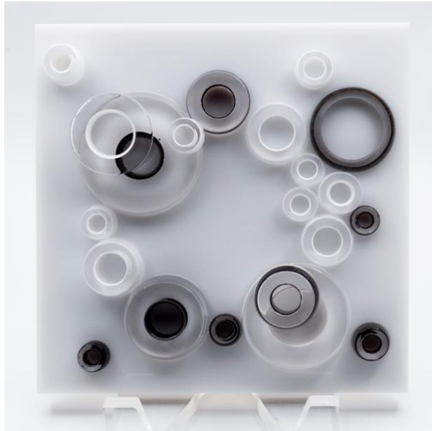
Minami Oya "Energy Portraiture in B&W No.37" Glass, acrylic panel

Primarily working in glass, Oya believes the medium reflects conflicting human qualities: fragility and strength, transparency and opacity, darkness and light. She describes glass's capacity to be hurtful or shatter with mishandling or be soothing to a careful touch. Her abstraction, geometric forms, and monochromatic color palette provide an opportunity for contemplation and personal interpretation.