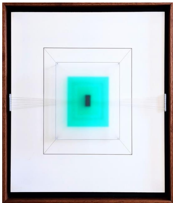
Ramiro Cairo "Tension and Hope" Pen, wire, thread, tinted polycarbonate, and plexiglass on plywood with kaolin clay

Opening Reception: March 2, 2024 5:30 pm - 7:30 pm with artist tour at 6:30 pm