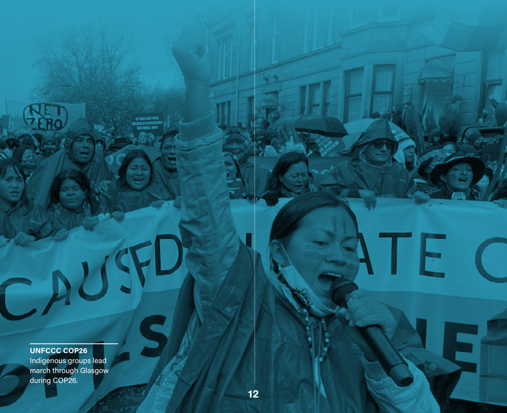
UNFCCC COP26 Indigenous groups lead march through Glasgow during COP26.