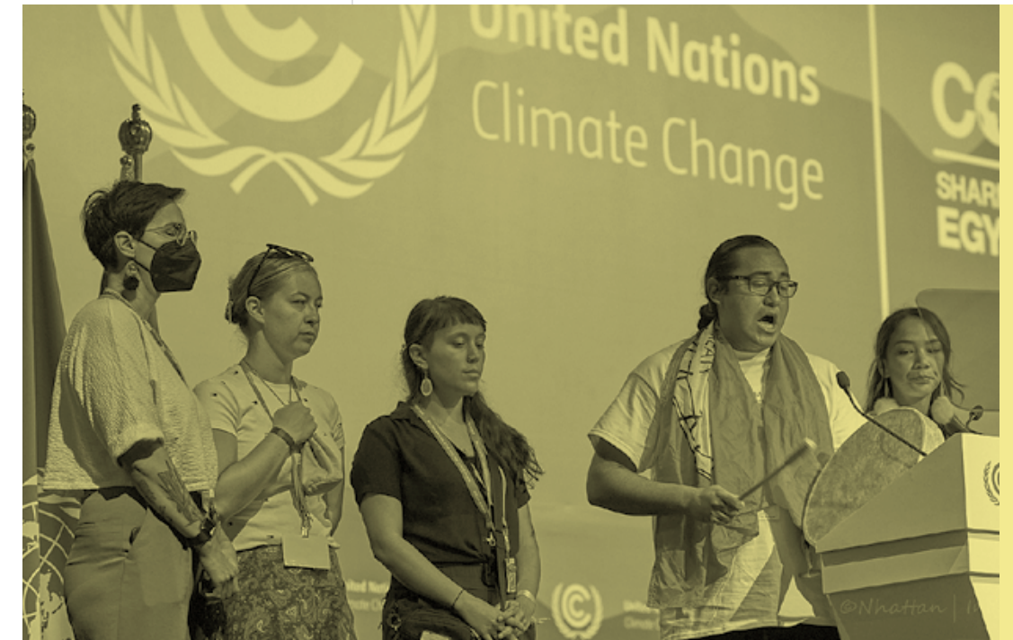
UNFCCC COP27 Indigenous land defenders from Canada singing at opening of People’s Plenary.