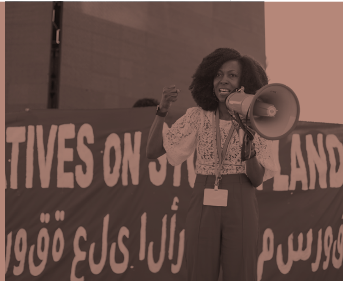
UNFCCC COP27 Indigenous groups take action under banner "No More Stolen Relatives on Stolen Land."