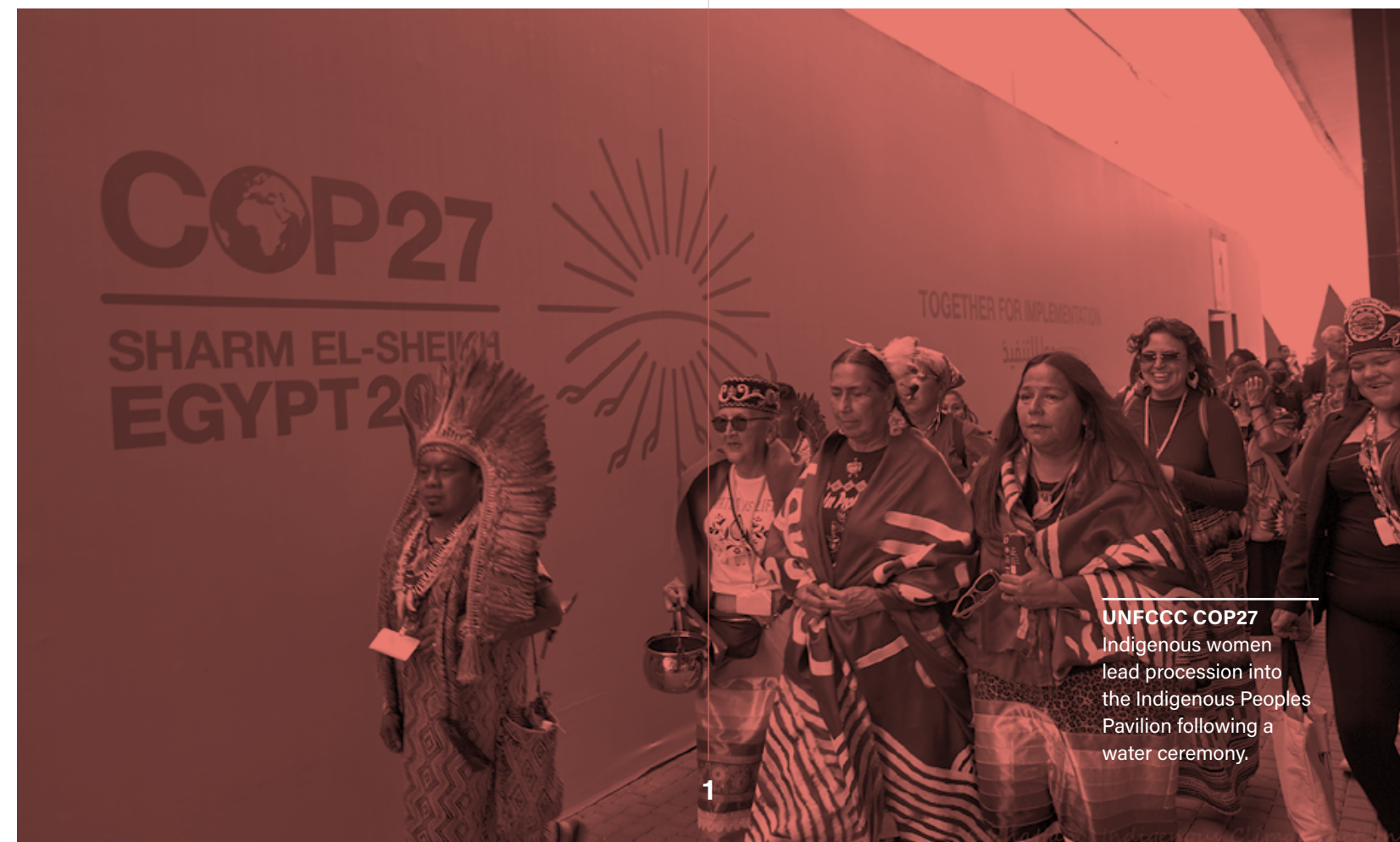
UNFCCC COP27 Indigenous women lead procession into the Indigenous Peoples Pavilion following a water ceremony.

This report provides a systematic analysis of Indigenous Peoples and their rights in the climate policies adopted by State Parties to the Paris Agreement adopted under the United Nations Framework Convention on Climate Change (UNFCCC). Section 1 outlines the key obligations states owe to Indigenous Peoples under international law in the context of climate change. Section 2 describes the methodology used to collect and analyze the climate policies. Section 3 presents the results of our analysis and discusses how states have acknowledged Indigenous Peoples in their climate policies. Section 4 summarizes the key conclusions of our analysis and provides recommendations for enhancing the protection, respect, and fulfillment of Indigenous rights in climate policymaking.