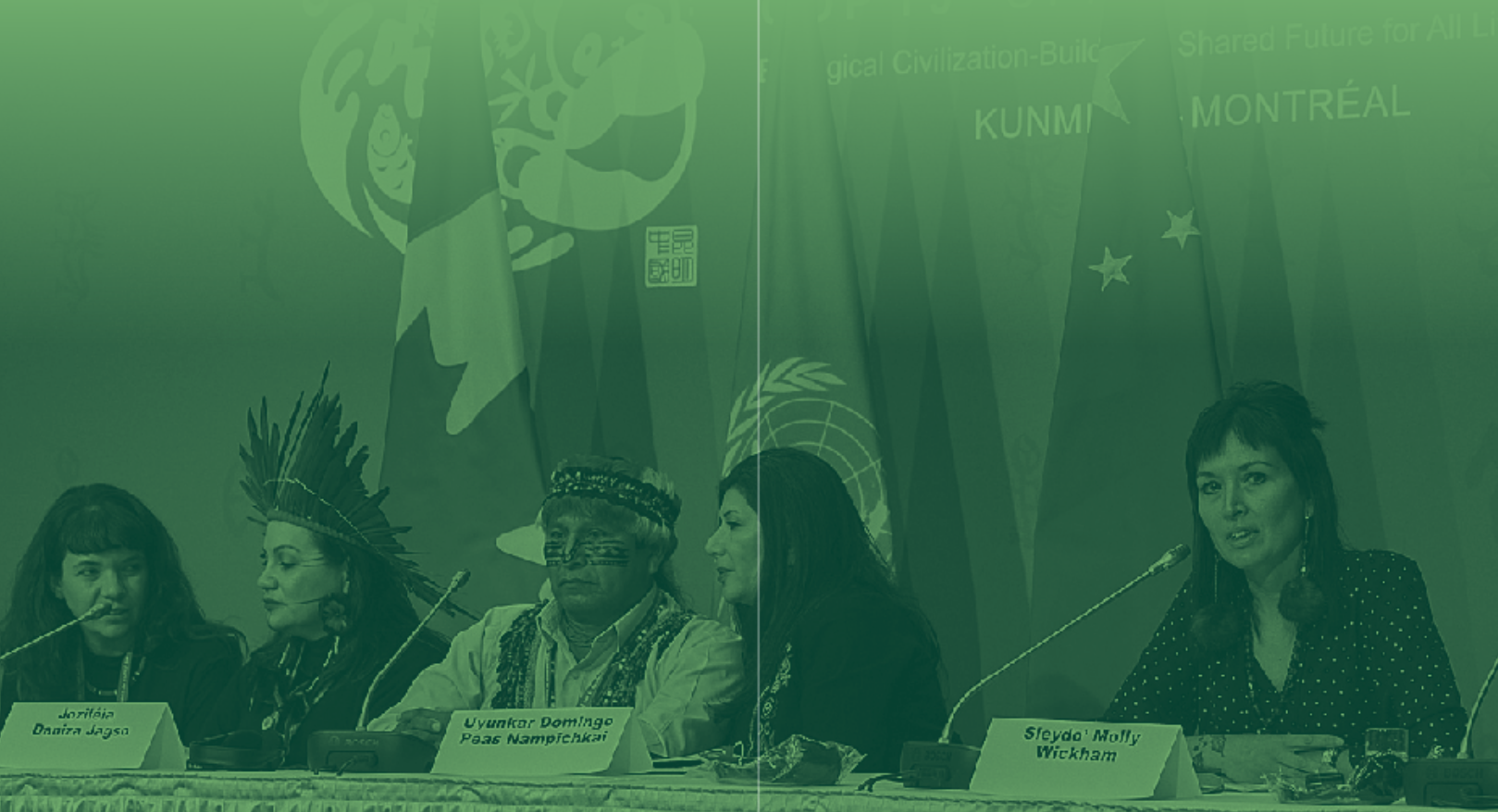
UN CBD COP15 Indigenous leaders speak at press conference as part of Indigenous Climate Action's Decolonizing Climate Policy project.

International law requires states respect, protect and fulfil the procedural and substantive rights held by Indigenous Peoples in the design and implementation of climate policies. In order to fully and effectively recognize the rights and sovereignty of Indigenous Peoples in the context of climate governance, governments are obligated to ensure the full and effective participation of Indigenous Peoples, to protect Indigenous knowledge systems, and to recognize and respect Indigenous jurisdiction over land.