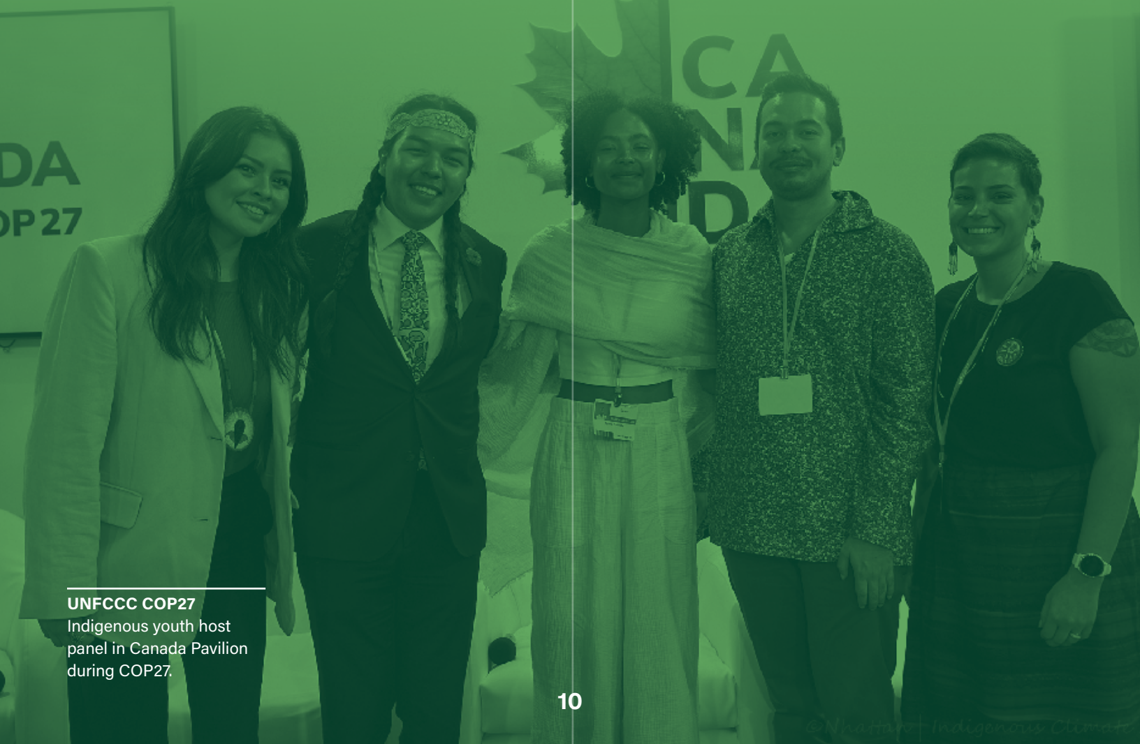
UNFCCC COP27 Indigenous youth host panel in Canada Pavilion during COP27.

To produce this report , we systematically collected the climate policies adopted by the 52 state parties to the Paris Agreement whose territories have been identified as having Indigenous Peoples in the 2022 annual report released by the International Working Group on Indigenous Affairs (IWGIA) 8 .