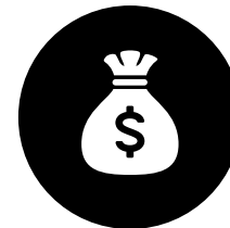
Higher Recurring Revenue