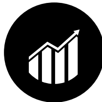
Higher Value Sales