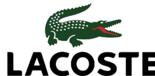
Combination Mark Example