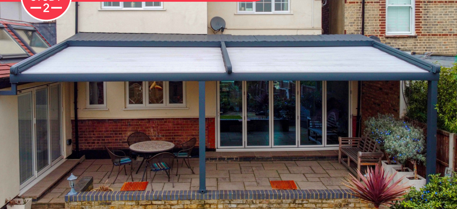
HORNSEY PROJECT, LONDON | INCLINED QUERCUS RHEA | Retractable Pergola