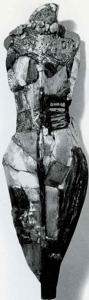
KNIGHT OF TOMORROW 542 80" x 24" x 17" WOOD, METAL, STONE