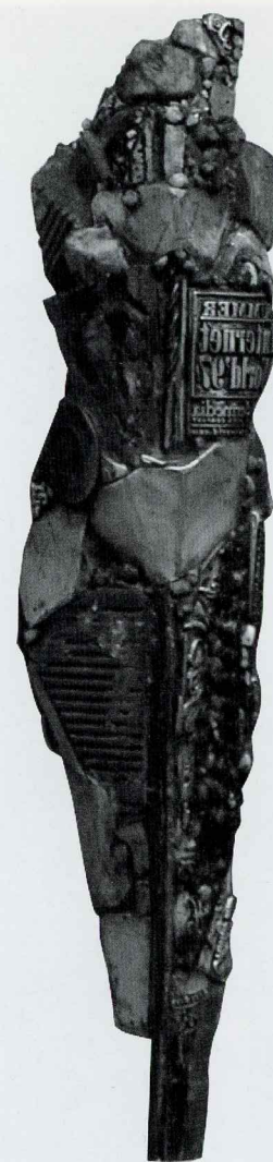
SUMMER KNIGHT 541 24" x 6" x 3" WOOD, METAL, STONE

Each of my Knights becomes a combination of Wonder Woman, the All-American uber-female of my youth; Princess Mononoke, the Japanese anime environmental Warrior Woman; and Kannon, the Asian Goddess of Protection and Mercy.