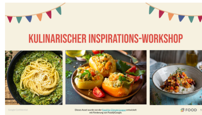
Workshop slide deck for Germany