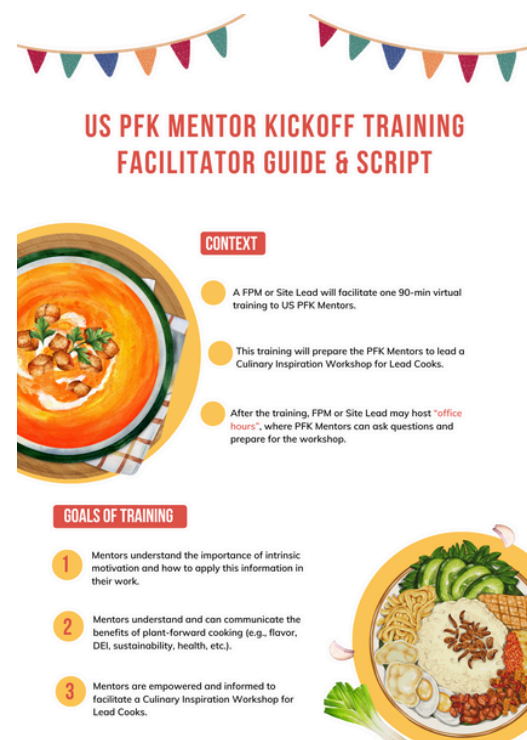
Facilitator Guide for US

After implementing and measuring the success of the initial Culinary Inspiration Program during a U.S. pilot, we created Workshop Toolkits using the train-the-trainer model to continue to inspire buy-in and drive registration for the Plant-Forward Kitchen (PFK) Training, created by Google in collaboration with the Culinary Institute of America (CIA).