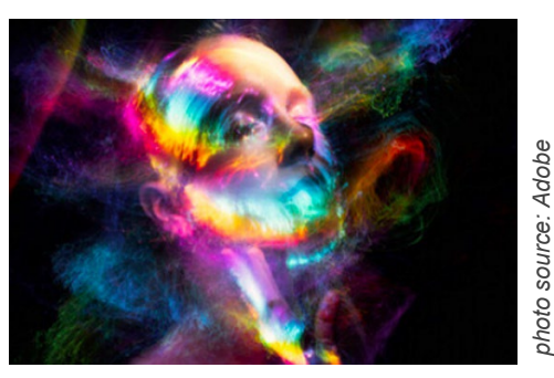
Evidence suggests that Psilocybin therapy may offer substantial improvements for serious medical conditions

Rose City Laboratories, opened its doors in 2012, and soon became the area's leading cannabis testing lab, and one of few Oregon accredited labs with both ORELAP and ANAB/ISO certifications. With their early potency and antigen testing success in the cannabis industry, Rose City Labs expanded to a broader market of environmental testing - propagating operations to include hazardous home invaders such as Asbestos, Radon, Lead, Nitrates, Heavy Metals and other common pollutants found in air, water and soil. By 2016, Rose City Laboratories grew to include five labs under one roof, offering extensive sample collection services as well as custom product testing. In 2019, a fleet of mobile labs were introduced to collect and rapid test Asbestos in commercial developments as well as the private sector. With the onset of COVID19, RCL pivoted to create custom PPE testing apparatuses for OHSU and other local health distribution companies. By Mid-2020, qPCR testing was introduced into Rose City Labs, and Microbiology took a front seat, processing Pathogens and Gender identification in cannabis, and more recently exploring Speciation testing in Fungi and now Psilocybin, once again broadening their scientific testing imprint within the state.