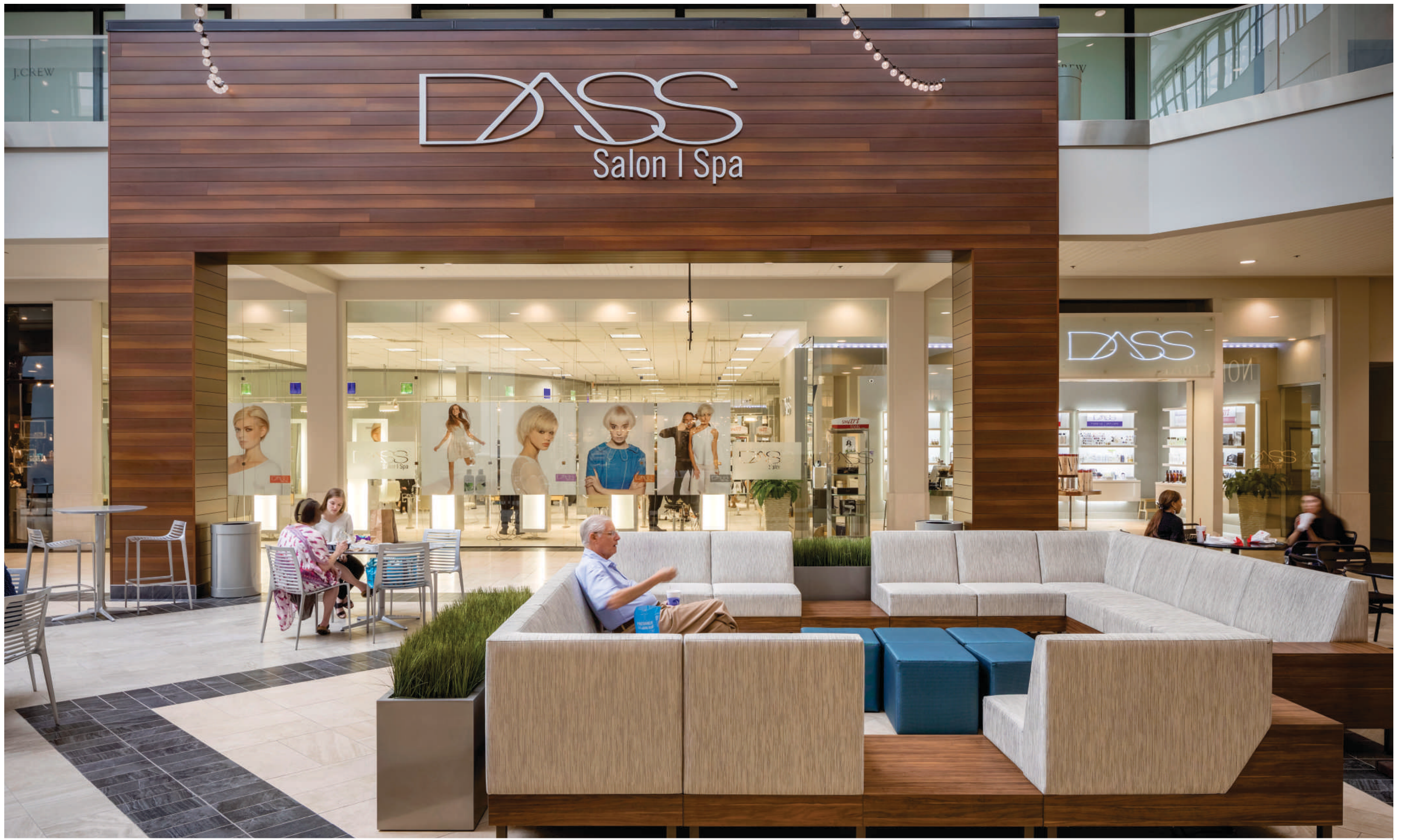
INTERIOR WALL PANELS

Location: Perimeter Mall, Atlanta GA Product: 4" V Groove Table Walnut