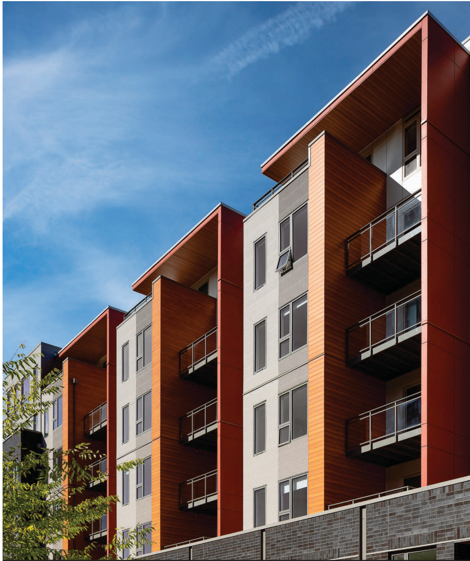
Uptown Apartments at Kirkland Urban - Kirkland, WA Architect: Weber Thompson Architects 6" V Groove Light Cherry