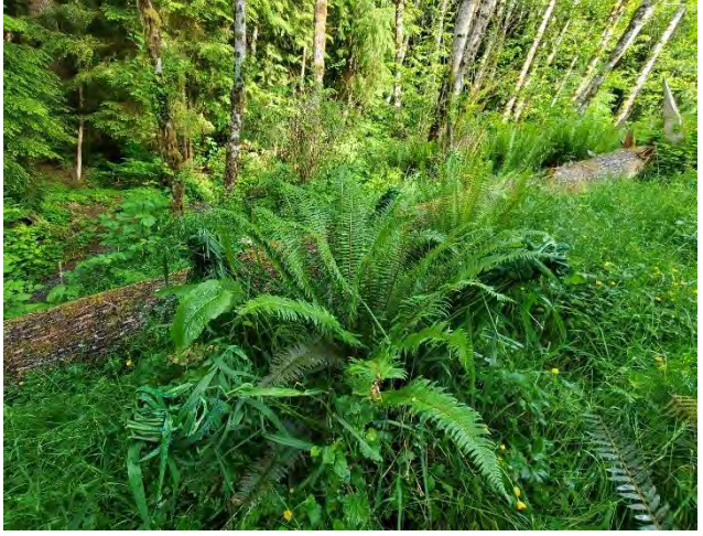
Photo 13: Reed canarygrass is bundled and pushed away from a native sword fern for treatment.