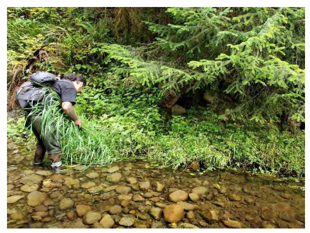
Photo 17: Reed canarygrass is pulled out of water and placed on the streambank prior to herbicide treatment.