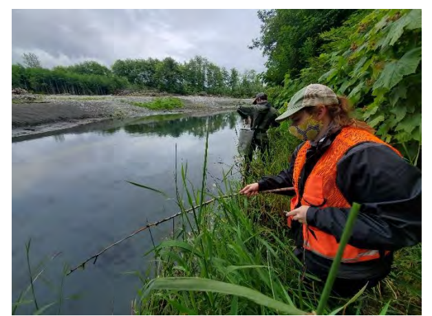
Photo 18: Reed canarygrass is pulled up from the river for de-heading, using a fallen branch.