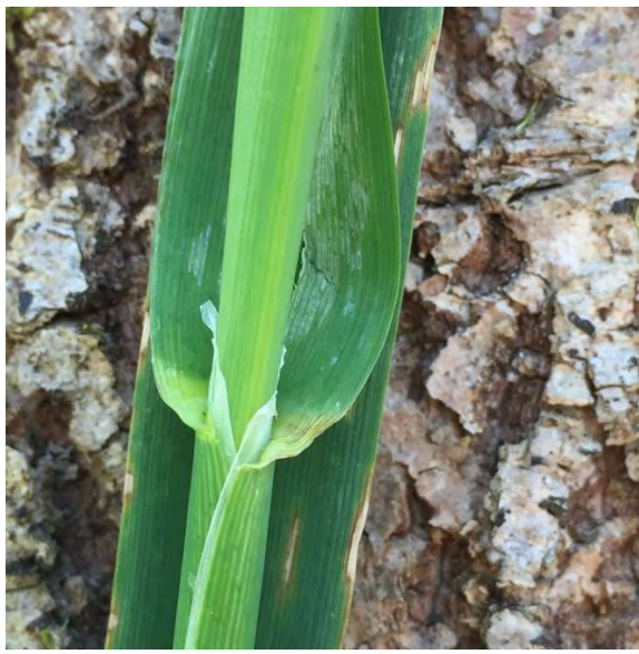
Photo 1: A membranous ligule is present where the leaf blade attaches to the stem.

Reed canarygrass is a perennial grass with creeping rhizomes that form a dense sod layer raising bed elevation in wetlands and other aquatic habitats (Thurston Co. EHD 2009). In the Pacific Northwest, reed canarygrass (RCG) emerges between late winter and early spring and exhibits a range of growth rates depending on light availability, substrate, and moisture level. Reed canarygrass is often identified by rigid and hollow stems, flat and wide (up to 2 cm) leaf blades, and membranous ligules ( Photos 1 and 2 ).