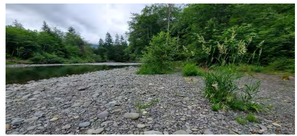
Photo 8: Treating small clumps of RCG along rivers and roads is the highest priority, as seeds travel in river and ditch flow. Don't walk by - remove those seeds.

Early action on small populations is the most effective action to reduce reed canarygrass, locally and across watersheds. The combination of preventing dispersal of RCG seeds during regular surveys and eradicating small populations reduces long-term management costs and effort and supports the maintenance of healthy native riparian and aquatic habitats.