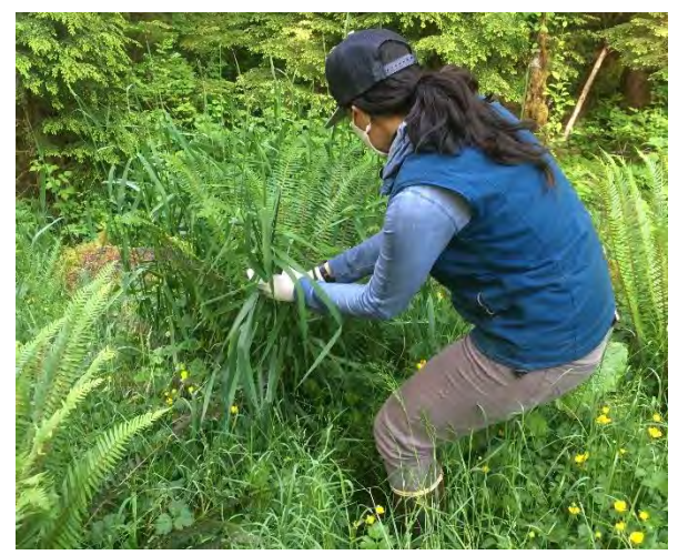
Photo 12: Reed canarygrass is untangled from a native sword fern patch.

If reed canarygrass is growing in or alongside native vegetation avoid herbicide overspray by untangling and bundling reed canarygrass ( Photos 12 and 13 ). To bundle reed canarygrass, gather stems by gently pulling out of native plants, starting from the base of the RCG clump. Twist the stems to form a loose knot. Avoid breaking stems, as herbicide will be less able to translocate to the roots. Spray bundles with herbicides as described above. Spray the exterior of the bundle, the top of the bundle, and with the wand inside the bundle. Native plants can be protected if they are pushed aside by stepping on the stem, pushed outward and held down by fallen branches, or bent or cut away before spray treatment ( Photo 13 ). Unsprayed native plants return the following season, reducing impact and replanting costs.