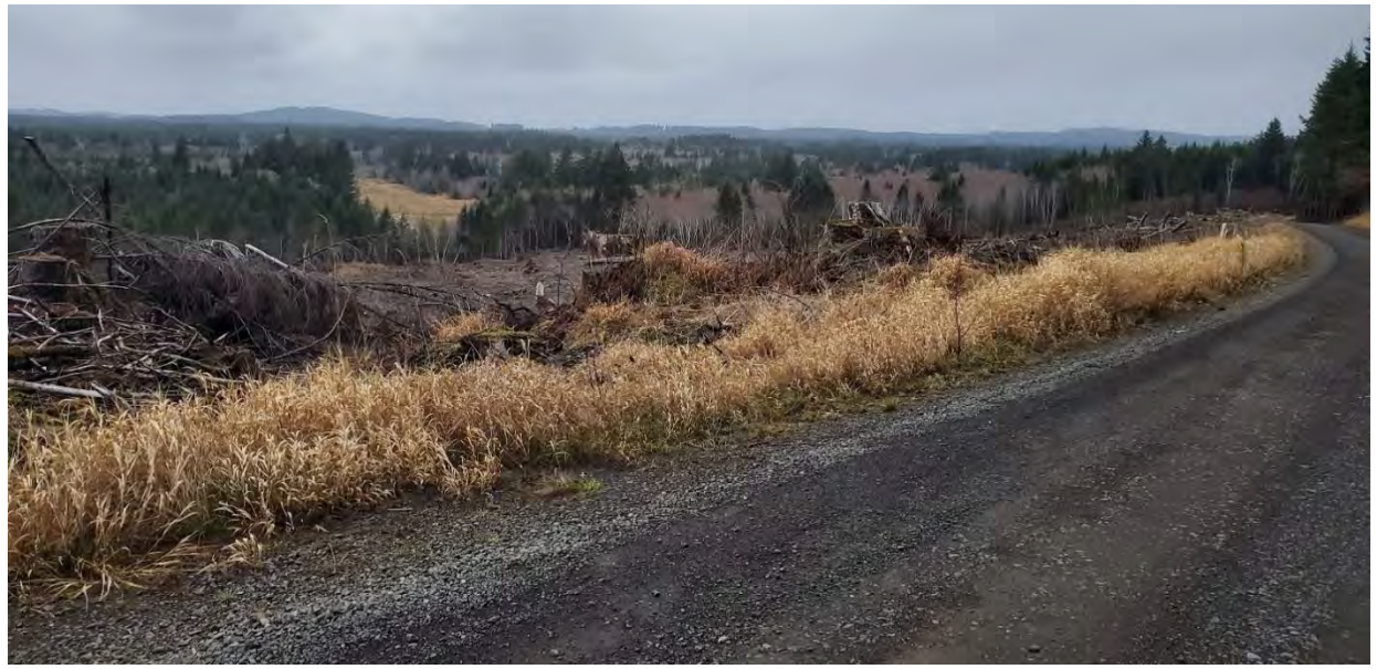
Photo 10: Roadside reed canarygrass inventoried during the winter for future treatment. The blonde color is clearly visible in other site types.

Manual control of reed canarygrass florets is most effective between late spring to early fall, to be completed before seeds have ripened. Site condition and exposure to sun influence reed canarygrass growth and treatment timing. Reed canarygrass in direct sunlight will grow, flower, and produce seed earlier than in shade, such as the roadside population shown below.