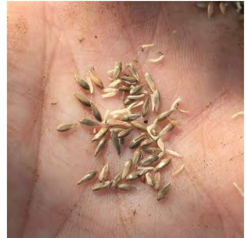
Photo 3: RCG seeds collected in July.