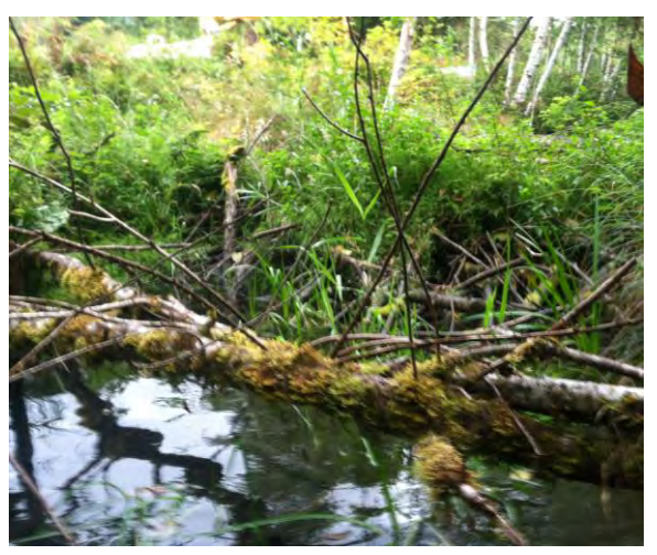
Photo 7: RCG caught on woody debris, rooting in stream substrate.

Reed canarygrass is a highly invasive species that outcompetes and displaces native vegetation (Laverge et al. 2019). As RCG spreads to form monotypic stands, native plant diversity is reduced and habitat structure and functions are altered (Weilhoefer et al. 2016; Spyreas 2010). Stream and wetland hydrology is altered as stems and rhizomes decrease water velocity and trap sediment, filling wetlands and riverine side channels; reducing access to juvenile salmon rearing and refuge (Lestelle 2011; Antieau 2008; Tu 2004). Water temperatures rise and dissolved oxygen is lowered as a result of decreased flow and decomposition of plant biomass. Aquatic prey species production is reduced in RCG-dominated stands (Weilhoefer et al. 2016; Borde et al. 2015), and amphibian reproductive success is lower (Hallock 2013). In agricultural settings, RCG results in conversion from wet to dry pasture, and has historically been recommended and utilized for that purpose (Stanndard & Crowder 2001). Water flowing through pastures into wetlands and tributaries to mainstem rivers carries seeds that are observed to establish new populations far from the original agricultural setting (Kercher & Zedler 2004, 10KYI obs.).