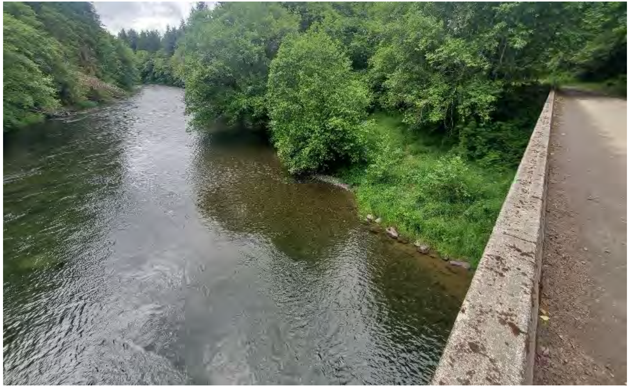
Photo 16: Reed canarygrass invasion along a roadside, extending to the river's bank, and acting as a source to downstream reaches, wetlands, and riparian floodplains.