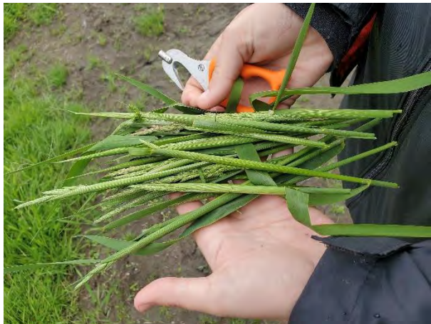
Photo 8: Reed canarygrass florets cut and placed into a heavy paper bag inside a tree planting bag, prior to disposal by burning.