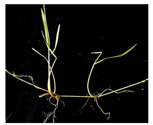
Photo 4: RCG stems growing from a single rhizome.

Cloned reed canarygrass plants grow from rhizomes and tillers (Waggy 2010) ( Photo 4 ). Rhizomes may grow over three meters per year and form dense deep mats ( Photo 5 ). While reed canarygrass favors full sun, the rhizomes enable the plant to spread and persist in heavily shaded areas. When reed canarygrass stems are grazed, cut, mowed, or otherwise injured, regrowth occurs from the rhizomes, and has been observed moving underground up wet slopes in native shrub communities (10KYI obs.).