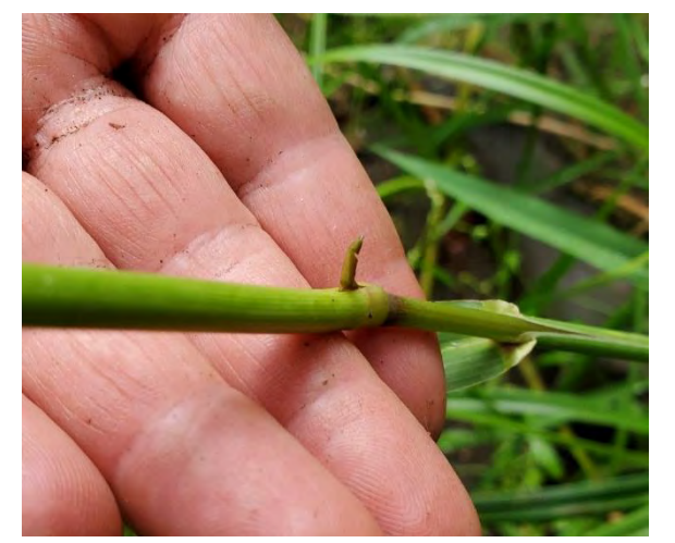
Photo 6: RCG root growing from a stem node.

Reed canarygrass stem and rhizome fragments resulting from high flow events, river scour, mowing, and beaver-cutting produce cloned reed canarygrass plants, contributing to the success of reed canarygrass in riverine zones of disturbance and deposition. On the upright stem, roots and stems grow from stem nodes ( Photo 6 ). Stem and rhizome fragments and clumps of eroded RCG float and will root and sprout when deposited on damp soil or anchored under stream cobble, or catch on instream woody debris, and root in stream substrates below ( Photo 7 ).