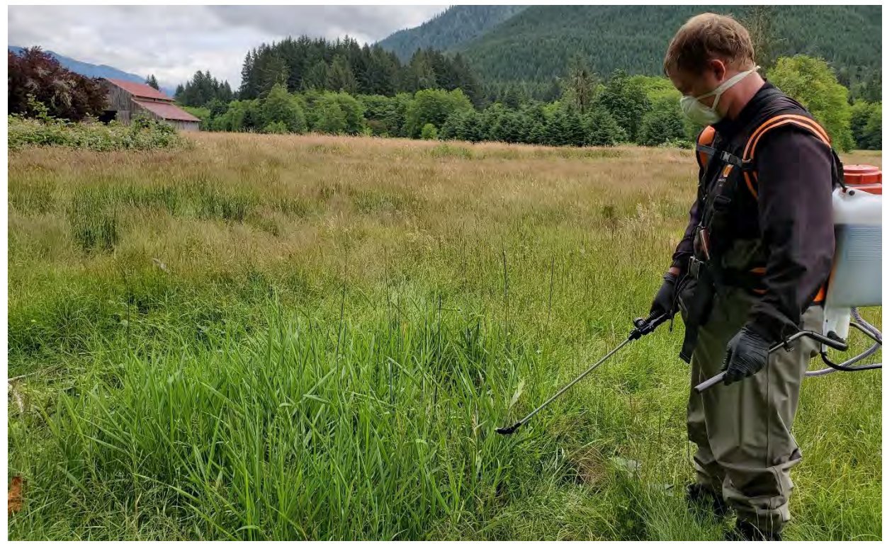
Photo 15: Spray treatment of a RCG clump, after manual floret and seed removal.