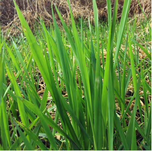
Photo 2: The flat leaf blades on new RCG growth.