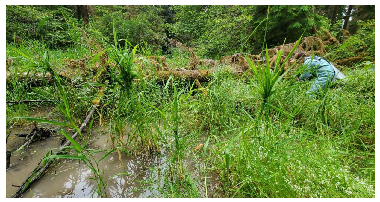
Photo 11: Scattered reed canarygrass bundled prior to spot treatment.