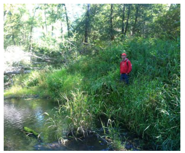
Photo 5: Dense mats of rhizomes establish and build up on instream wood and beaver dams.