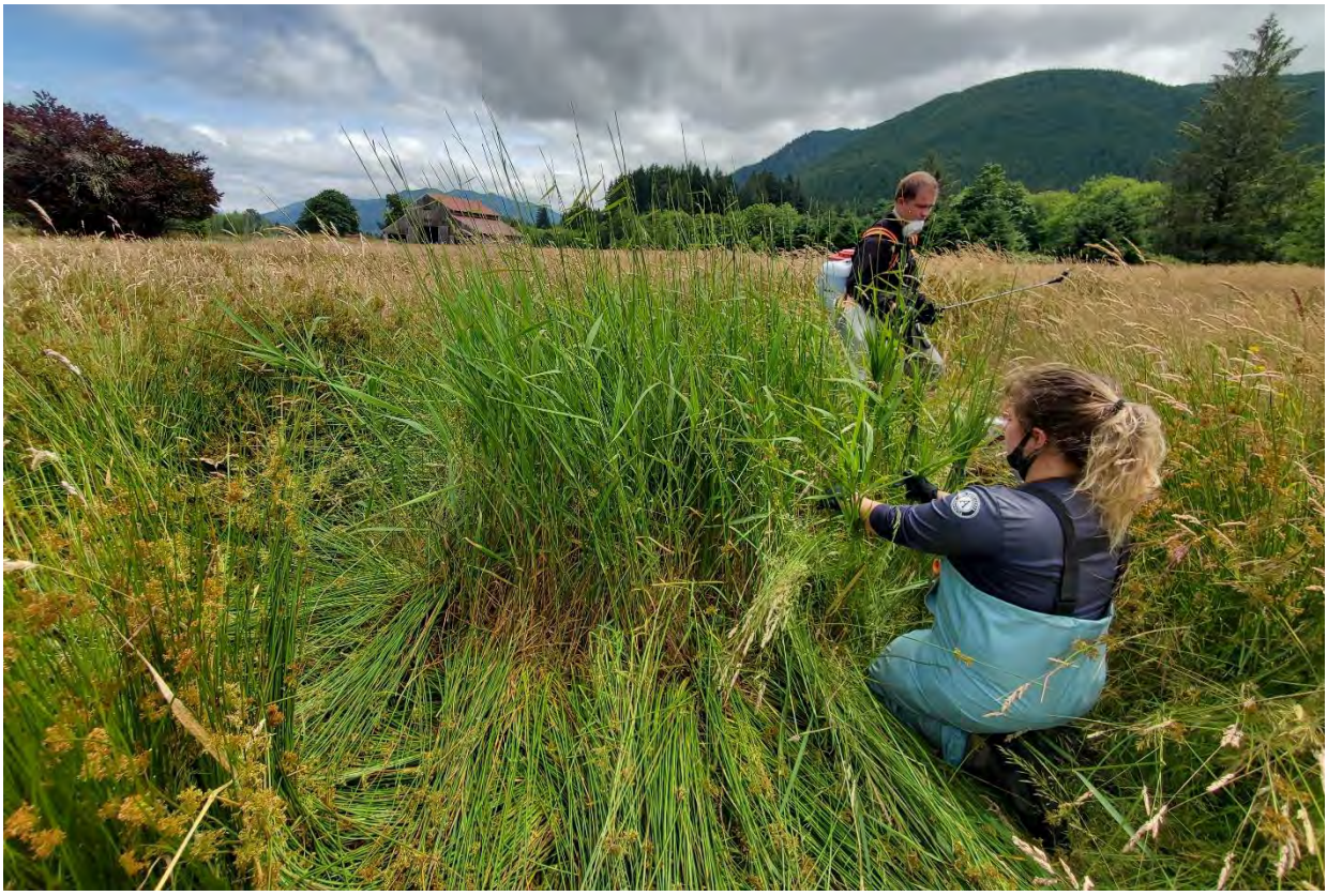
Photo 14: Native rush is bent away from a reed canarygrass patch to protect from spray – so the rush will regrow, and the RCG will be controlled.