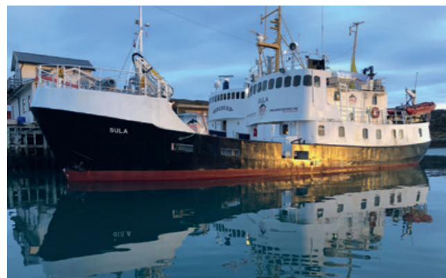
An adventure of a lifetime awaits passengers boarding the Sula .

The waters off the Troms region in the far north of Norway host hundreds of orcas each winter from the