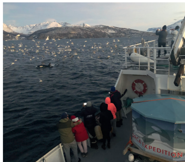
Learning how to interact respectfully with orcas is a key feature of the Sula expeditions.

Looking around the boat, I could see everyone felt much the same. Crew and guests alike were beaming, chatting about the baby orcas we’d seen earlier swimming