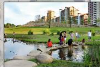
Stepping Stone Pathways