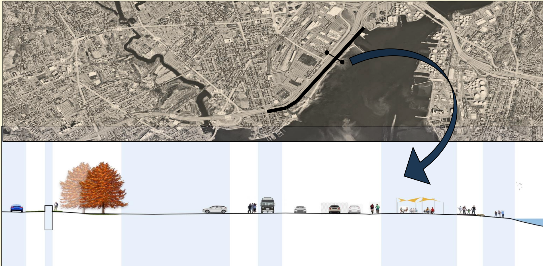
I-95 & Flood Wall