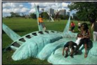
Landmark Interactive Sculpture