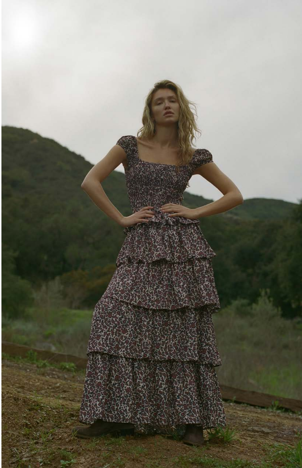
CATALINA DRESS PAISLEY