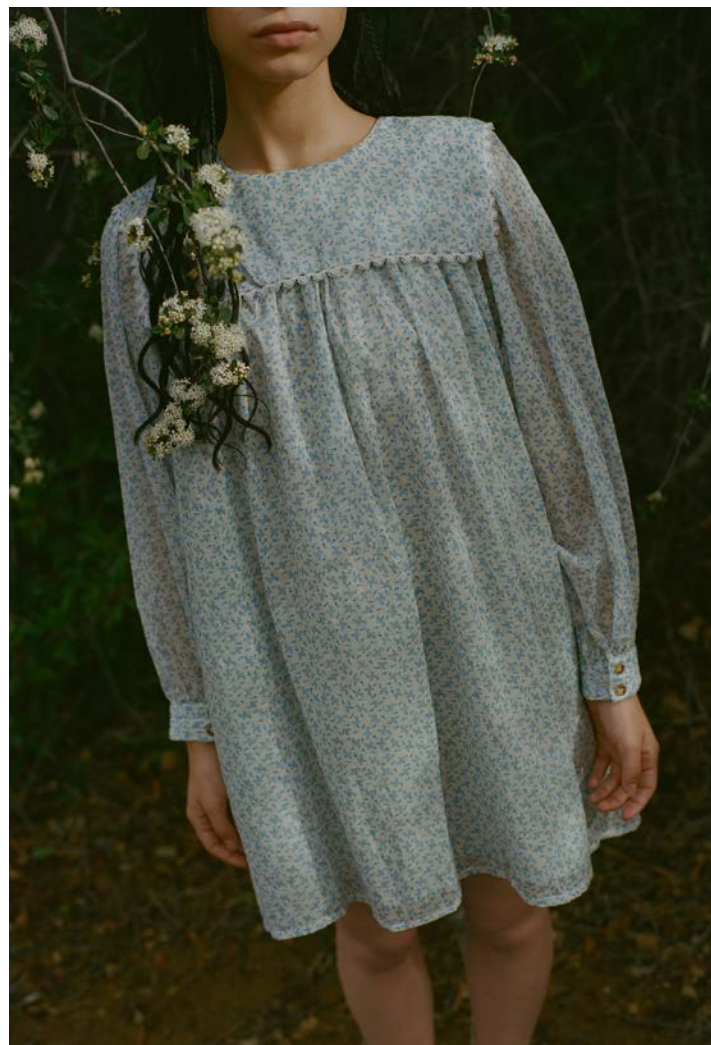
CLOE DRESS THISTLE