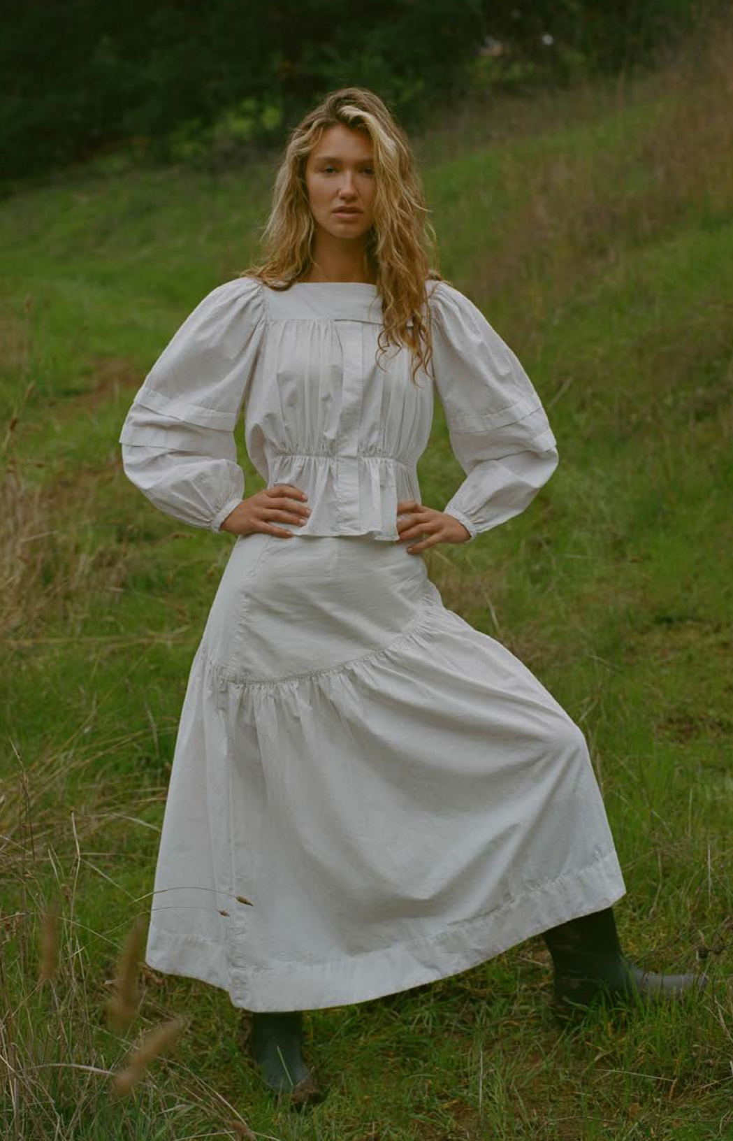
CARLOTTE TOP WHITE ELIANA SKIRT WHITE