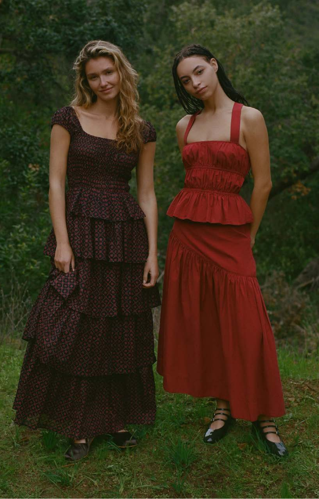
L: CATALINA DRESS CURRANT R: MAYA TOP AND ELIANA SKIRT JAM