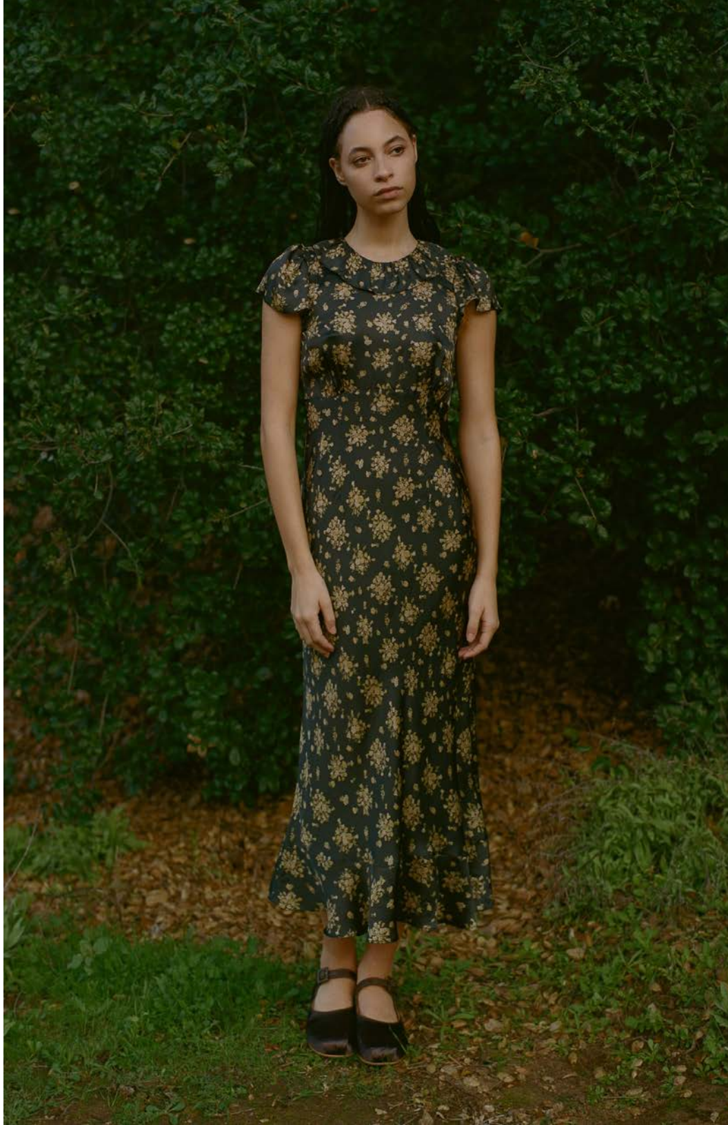
LILI DRESS BEGONIA