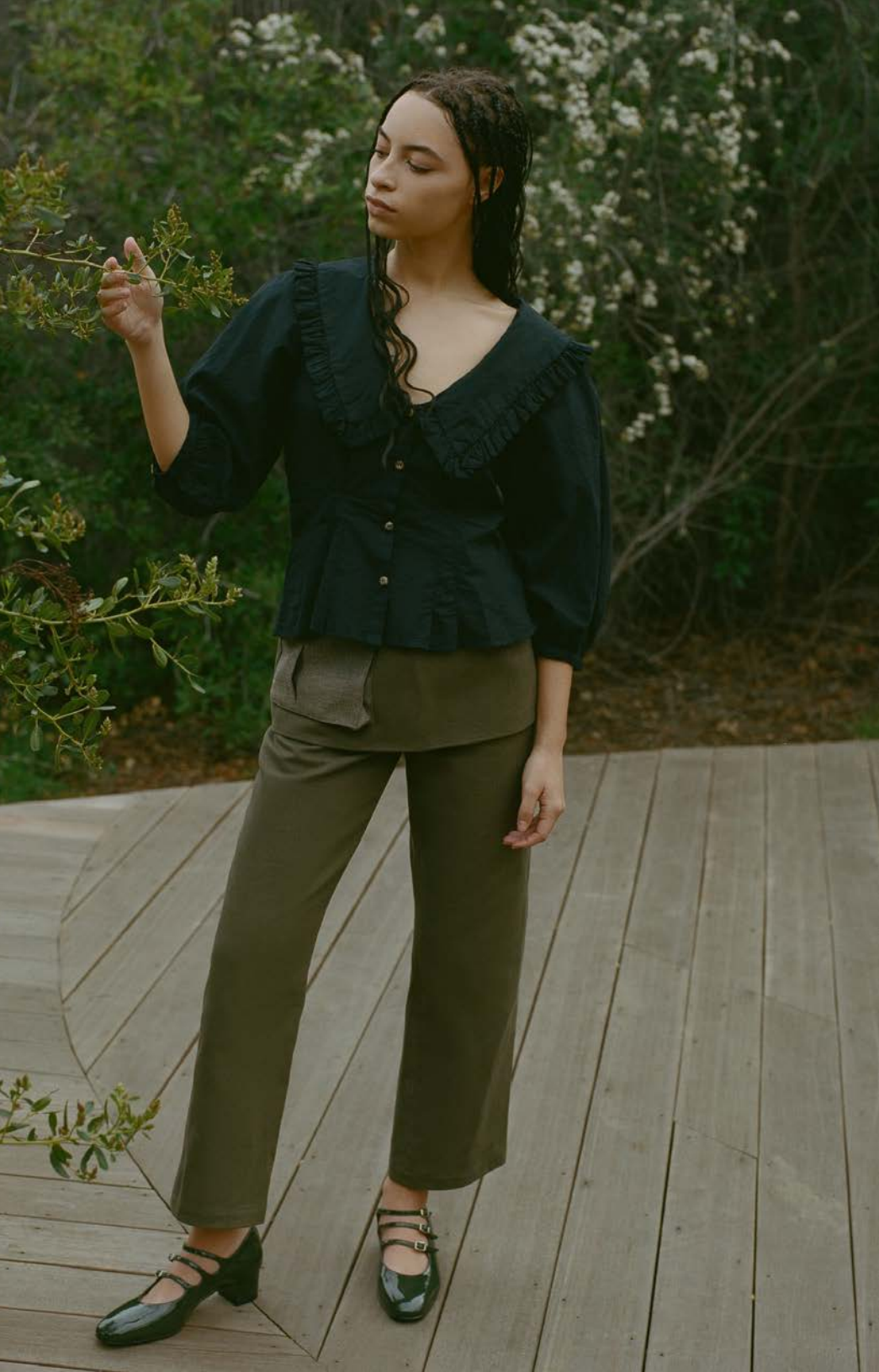
EMA TOP BLACK BERNARDO PANT TWINE