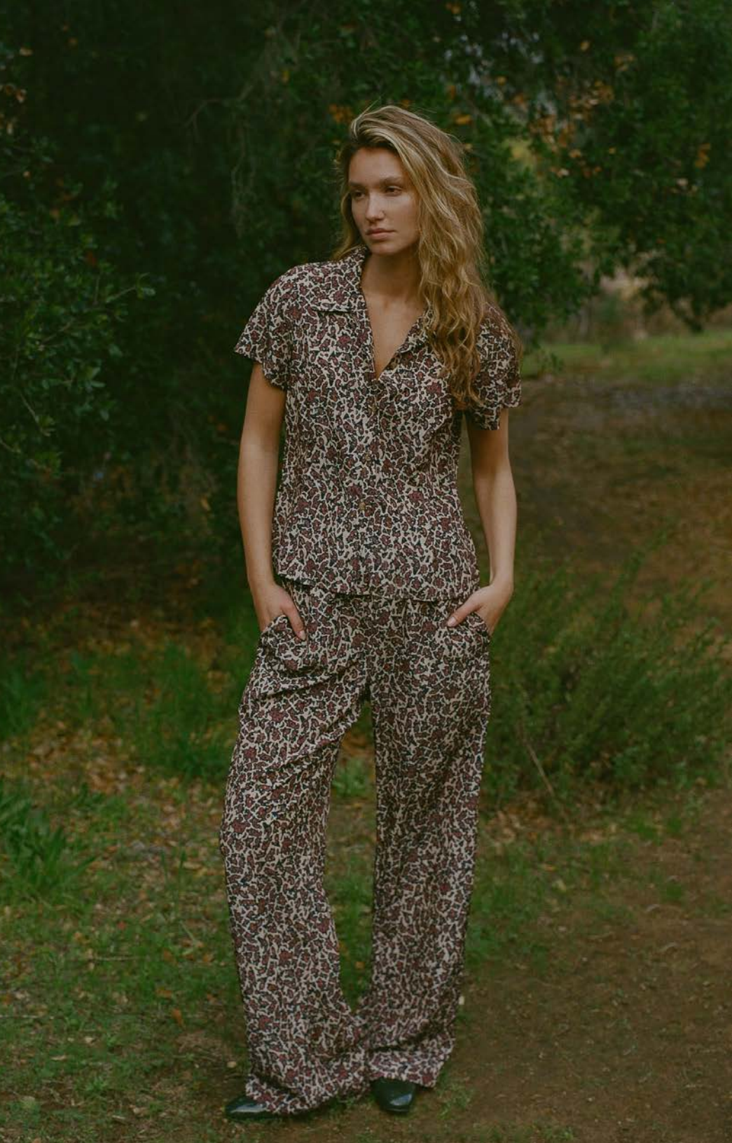
ELLIN SHIRT PAISLEY BARCA PANT PAISLEY