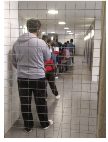
Lineup of tenants, leading out the lobby doors, waiting for repairs on broken elevators.