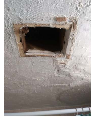
Washroom ceiling missing ventilation in a tenant's unit.