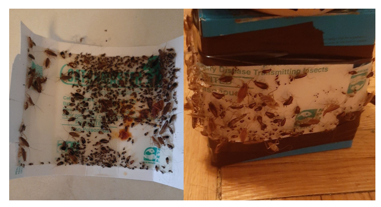
Cockroach traps in a tenant's unit.

continue registering their substantial holdings under untransparent shell companies, and adopt similar business strategies as 'financialized' landlords.