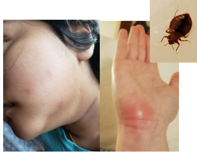
Bed bug and bed bug bites in a tenant's unit.