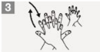
3 Right palm over left dorsum with interlaced fingers and vice versa;