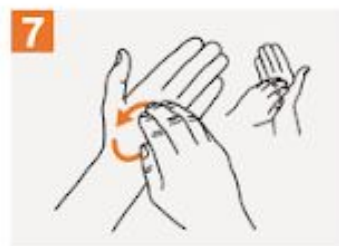
7 Rotational rubbing, backwards and forwards with clasped fingers of right hand in left palm and vice versa;