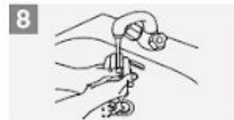
8 Rinse hands with water;