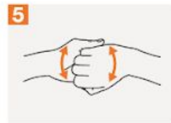
5 Backs of fingers to opposing palms with fingers interlocked;