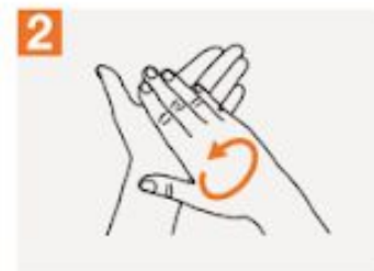
2 Rub hands palm to palm;