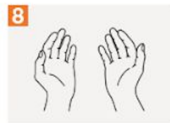
8 Once dry, your hands are safe.