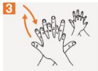
3 Right palm over left dorsum with interlaced fingers and vice versa;