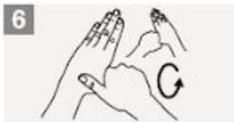
6 Rotational rubbing of left thumb clasped in right palm and vice versa;