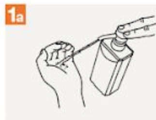
1a Apply a palmful of the product in a cupped hand, covering all surfaces;

🕒 Duration of the entire procedure: 20-30 seconds