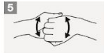
5 Backs of fingers to opposing palms with fingers interlocked;