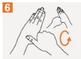
6 Rotational rubbing of left thumb clasped in right palm and vice versa;