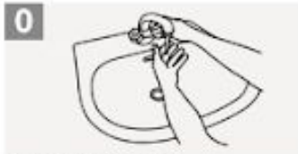
0 Wet hands with water;