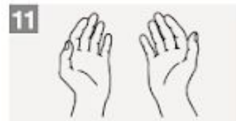
11 Your hands are now safe.