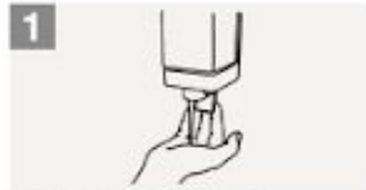
1 Apply enough soap to cover all hand surfaces;