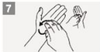
7 Rotational rubbing, backwards and forwards with clasped fingers of right hand in left palm and vice versa;