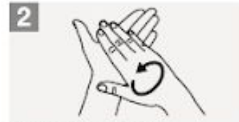
2 Rub hands palm to palm;