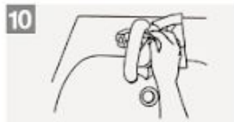
10 Use towel to turn off faucet;