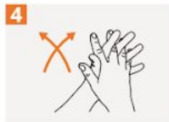
4 Palm to palm with fingers interlaced;