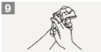
9 Dry hands thoroughly with a single use towel;