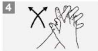
4 Palm to palm with fingers interlaced;