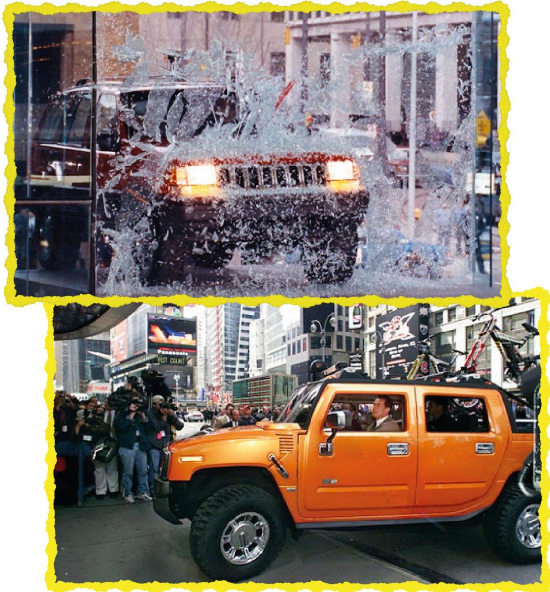
Ford Explorer launch at Detroit auto show in 1992; Arnold Schwarzenegger unveils the new Hummer H2 in downtown Manhattan in 2001.