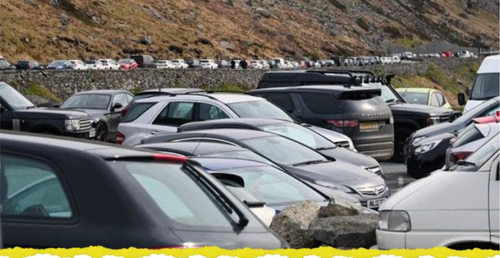
Cars parked at the base of Mount Snowdon, Wales, 2020.

nowhere. Sometimes in the middle of nowhere you find yourself.” [Hummer, 2001]. 57 This may be true of course, but not at the wheel of a car.