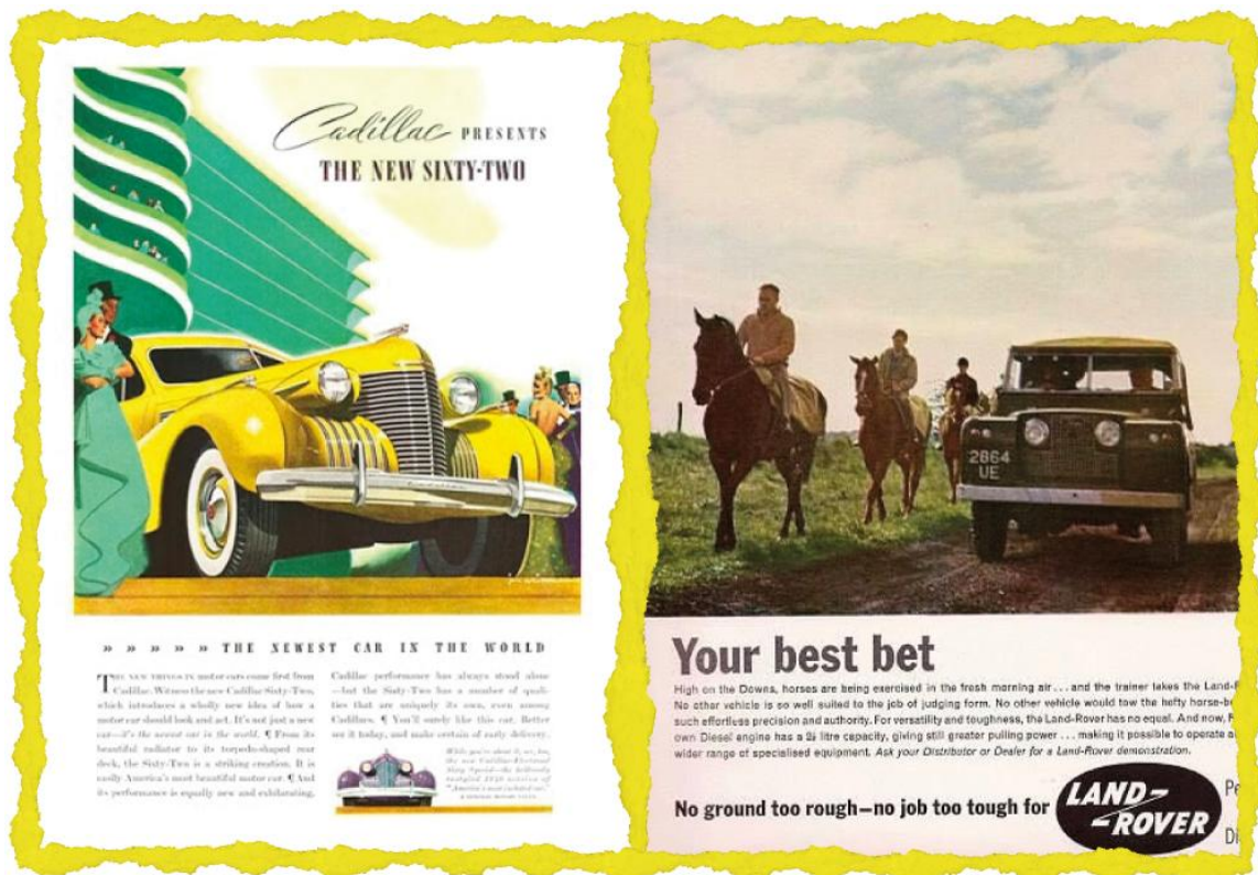
1939 Cadillac advert and 1961 Land Rover promotion