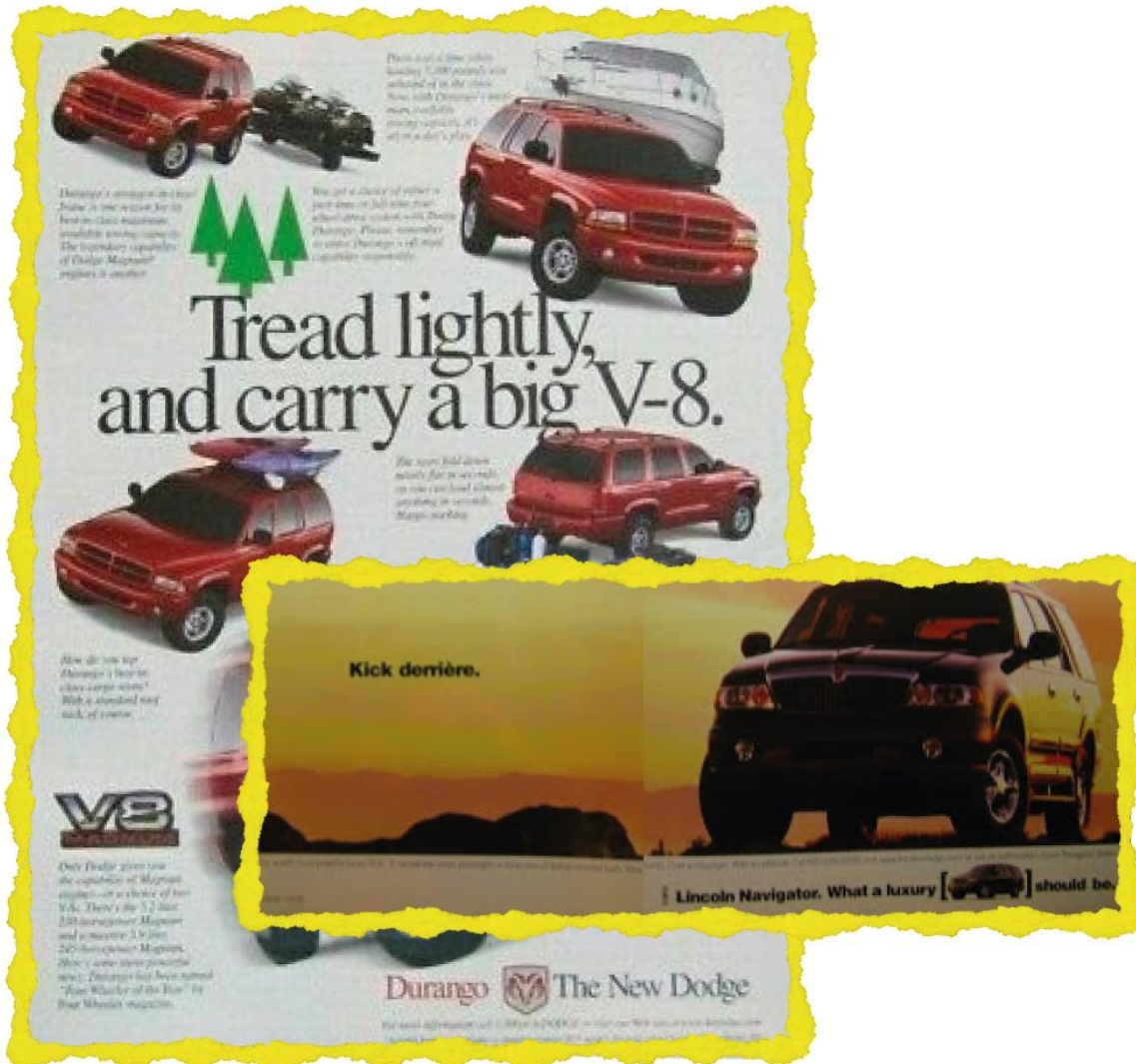
Dodge Durango "Tread lightly" V-8 print ad, 1998; Lincoln Navigator "Kick derrère" print ad, 1999.

Like the Blazer above, campaigns for Hummer and Jeep were increasingly shot from a position just below the front bumper: we are made to feel prostrated before the vehicles.