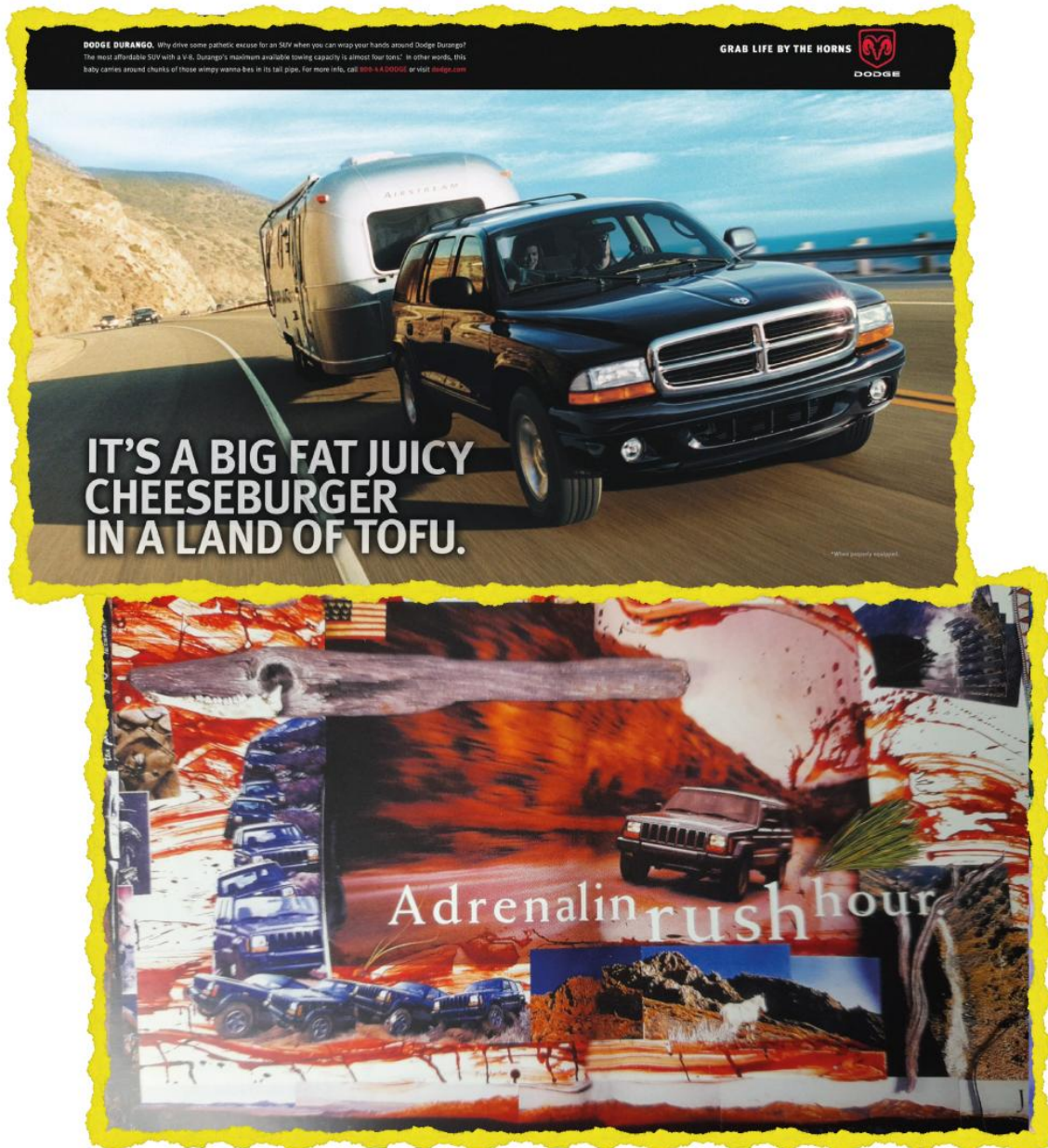
Dodge Durango ad (top) and Jeep Cherokee ad (bottom).

We realise their tongue was firmly in the cheek, but fomenting strife between town and countryside feels more dangerous a decade later.