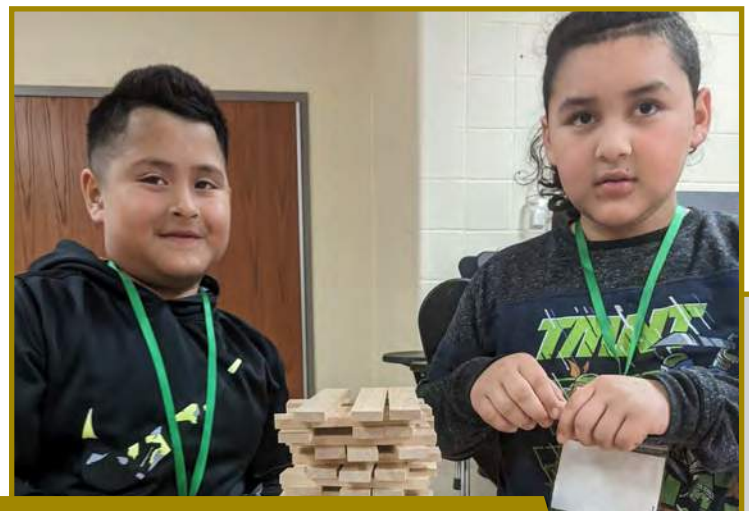
Promoting Multiculturalism and Education Equity

The Community Foundation supported the nonprofit, Strings, Inc., with a $5,085 grant for a new Violin Project at Jasper Elementary School. This pilot program offers free group violin instruction to first graders. Research shows musical training improves self-esteem, motor and auditory skills and reading development in school-aged children, among the many other benefits of arts-based activities. The Violin Project removes socioeconomic barriers to promote the arts in the classroom. This grant was made possible by The Fund for Dubois County.