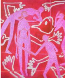
Jaqueline Cedar Put Me Out, 2017 Acrylic on fabric stretched on stretcher bars 72 x 60 inch 6000