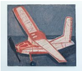
Kelly Popoff Model Airplane 3, 2022 Oil and wax on canvas 30 x 40 inch 2300