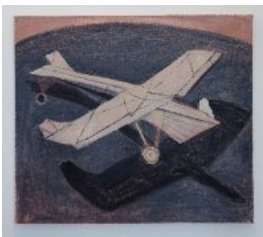
Kelly Popoff Model Airplane 2, 2022 Oil and wax on canvas 30 x 40 inch 2300