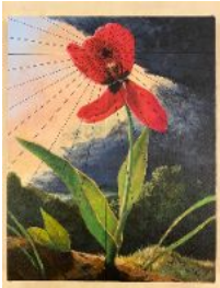
Pearl Cowan Radiant Void inside a Tulip, 2022 Watercolor gouache on canvas mounted on panel 14 x 11 inch 2200