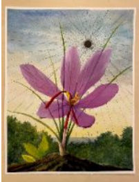
Pearl Cowan Radiant Void, 2022 Watercolor Gouache and ink on paper 18.5 x 14.5 inch 2800