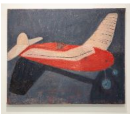
Kelly Popoff Model Airplane 1, 2022 Oil and wax on canvas 30 x 40 inch 2300