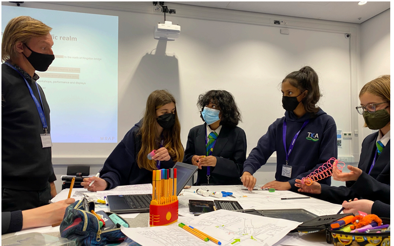
Design sessions and presentations with students at TKA