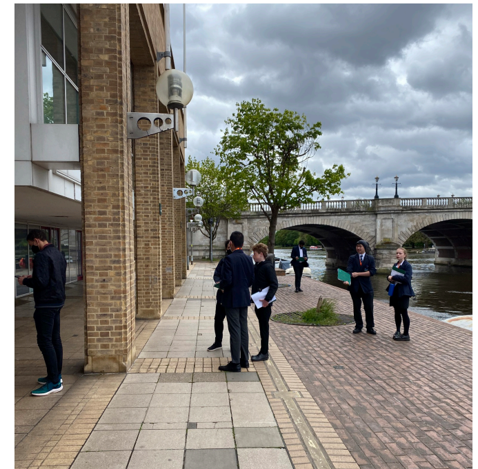
Site visits and design sessions with feedback from one of the students at TKA