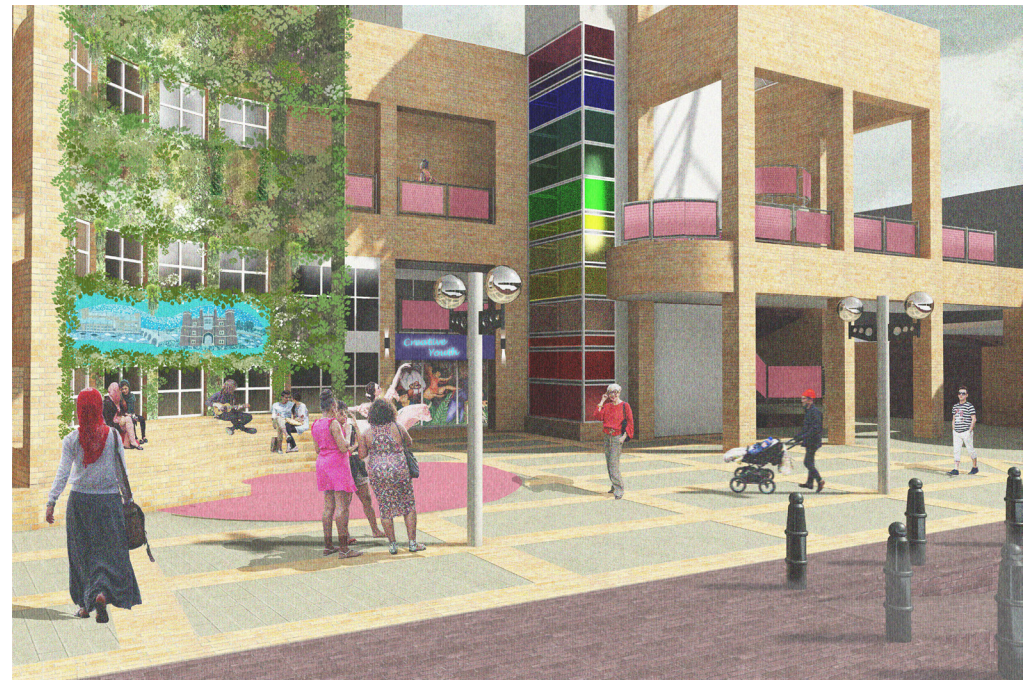
Student design session and final outcomes