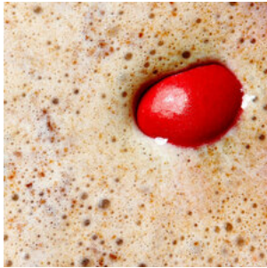
m&m's milkshake recipe