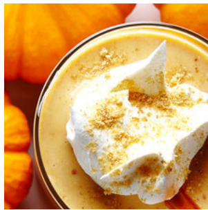
pumpkin pie milkshake recipe