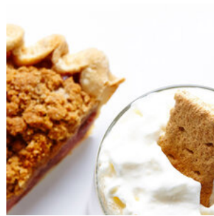
apple pie milkshake recipe