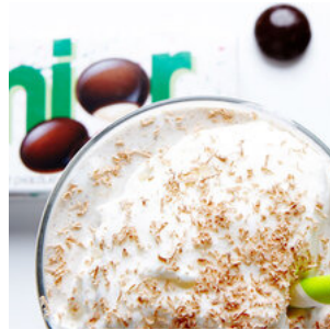
boozy junior mints milkshake recipe