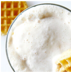
maple syrup milkshake recipe