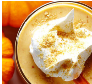
pumpkin pie milkshake recipe