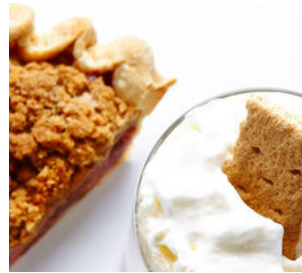
apple pie milkshake recipe