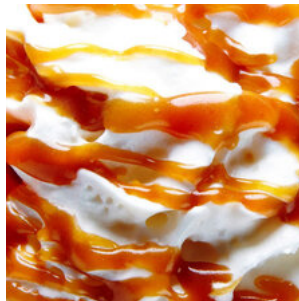
salted caramel milkshake recipe