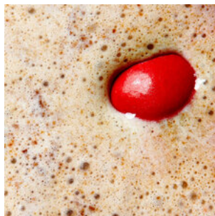
m&m's milkshake recipe