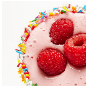
raspberry candy cane milkshake recipe