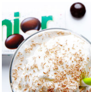
boozy junior mints milkshake recipe