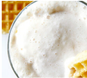
maple syrup milkshake recipe