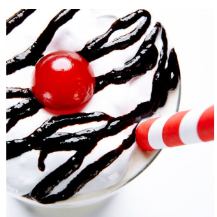
rum & coke milkshake