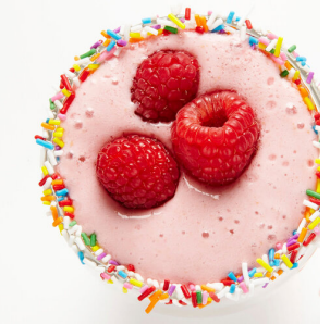
raspberry candy cane