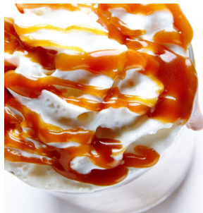
salted caramel milkshake