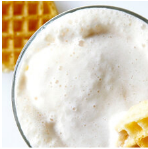
maple syrup milkshake recipe