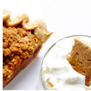
apple pie milkshake recipe