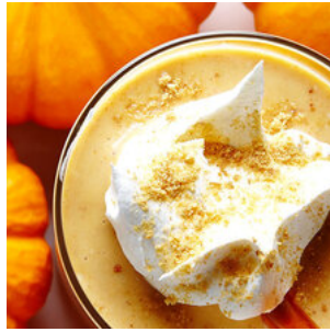
pumpkin pie milkshake recipe