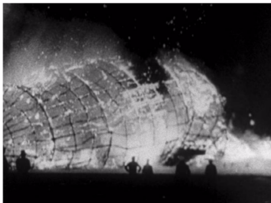
Bruce Conner. A MOVIE . Kohn Gallery, Los Angeles