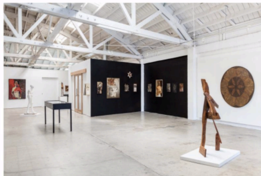
Rat Bastard Protective Association. The Landing, Los Angeles

As the stunning exhibition – worthy of a small museum – at Landing demonstrated, some Rat Bastard artists went wholly over into pasted papers and