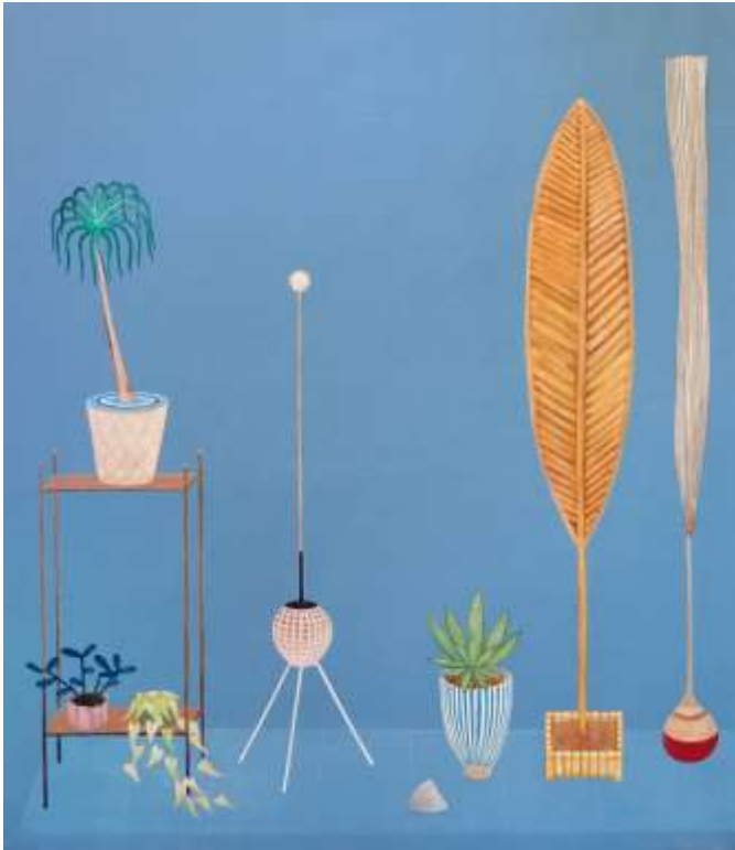
Future Primitives IV by Akira Ikezoe, courtesy the artist and Proyectos Ultravioleta

1326 s. boyle avenue los angeles, ca, 90023 www.parraschheijnen.com 3 2 3 . 9 4 3 . 9 3 7 3