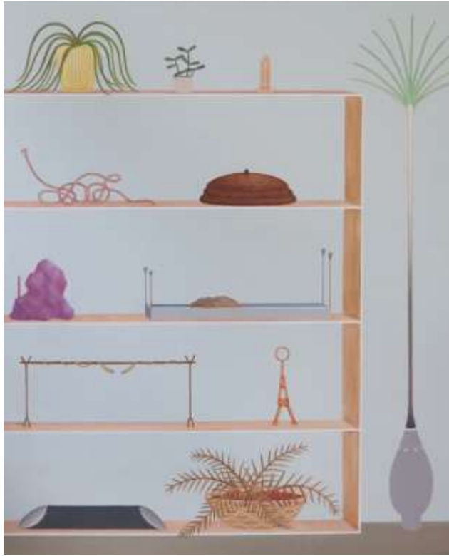
Future Primitives Shelf by Akira Ikezoe, courtesy the artist and Proyectos Ultravioleta

1326 s. boyle avenue los angeles, ca, 90023 www.parraschheijnen.com 3 2 3 . 9 4 3 . 9 3 7 3