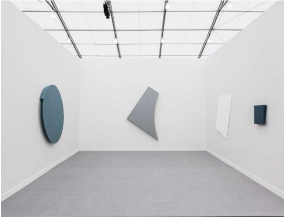
1980s Shaped Paintings by Tony DeLap, courtesy Parrasch Heijnen Gallery

1326 s. boyle avenue los angeles, ca, 90023 www.parraschheijnen.com 3 2 3 . 9 4 3 . 9 3 7 3