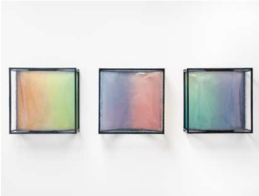
Light Filter Triptych 4 by Thomas Linder, courtesy Ibid Gallery

1326 s. boyle avenue los angeles, ca, 90023 www.parraschheijnen.com 3 2 3 . 9 4 3 . 9 3 7 3