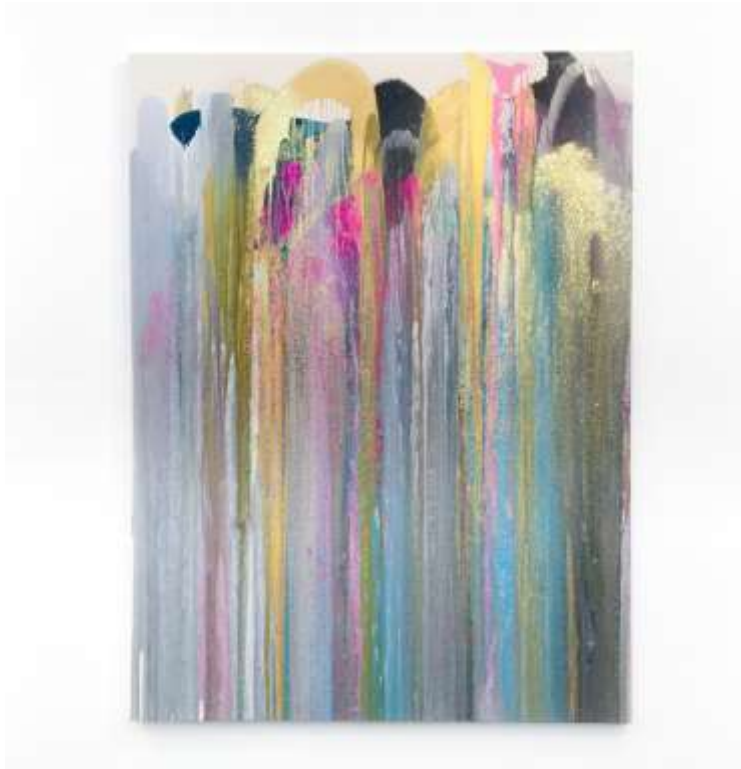
Painting by John Armleder for Almine Rech gallery

1326 s. boyle avenue los angeles, ca, 90023 www.parraschheijnen.com 3 2 3 . 9 4 3 . 9 3 7 3