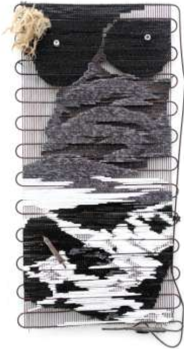
Untitled by Zoë Paul

1326 s. boyle avenue los angeles, ca, 90023 www.parraschheijnen.com 3 2 3 . 9 4 3 . 9 3 7 3