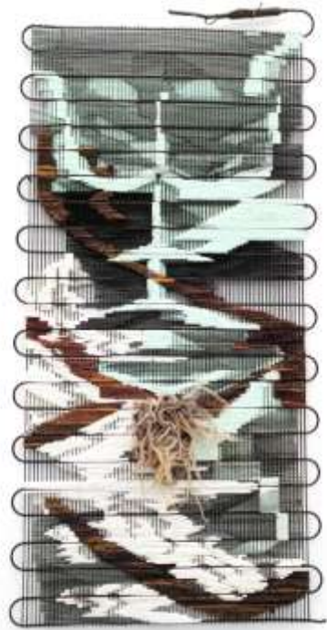
Untitled by Zoë Paul, courtesy of The Breeder, Athens

1326 s. boyle avenue los angeles, ca, 90023 www.parraschheijnen.com 3 2 3 . 9 4 3 . 9 3 7 3