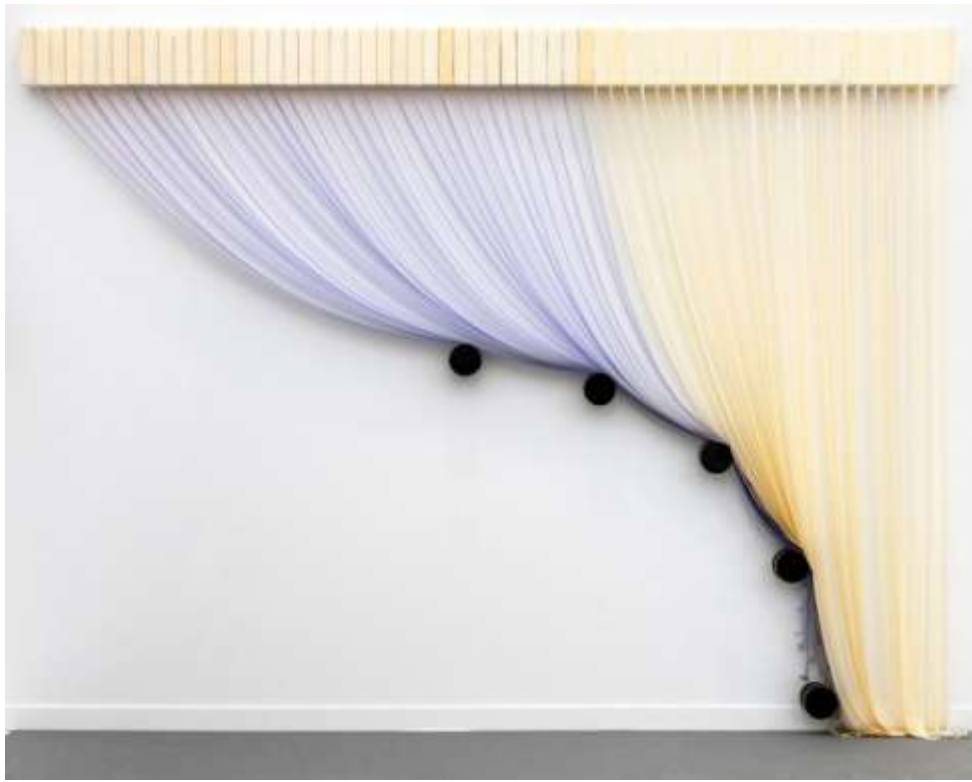
Parted Plastic by Eva LeWitt, courtesy VI, VII Oslo

1326 s. boyle avenue los angeles, ca, 90023 www.parraschheijnen.com 3 2 3 . 9 4 3 . 9 3 7 3