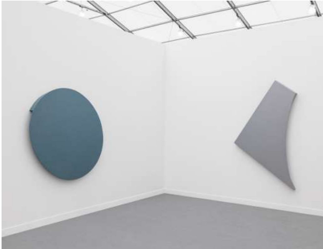
1980s Shaped Paintings by Tony DeLap

1326 s. boyle avenue los angeles, ca, 90023 www.parraschheijnen.com 3 2 3 . 9 4 3 . 9 3 7 3