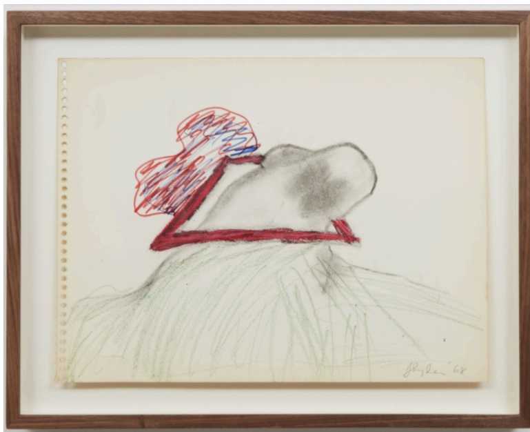
Joan Snyder, "Red Rectangle/Grabbing," 1968, charcoal , marker and crayon on paper, 11.5 inches by 14.5 inches. (Parrasch Heijnen Gallery)

Color counts for both artists — particularly when solid chunks of pink and blue, red and black, or brown and white grind together. Compositions, riven by internal tensions, keep harmony and resolution out of the picture. And that's where the greatest contrasts come into focus.