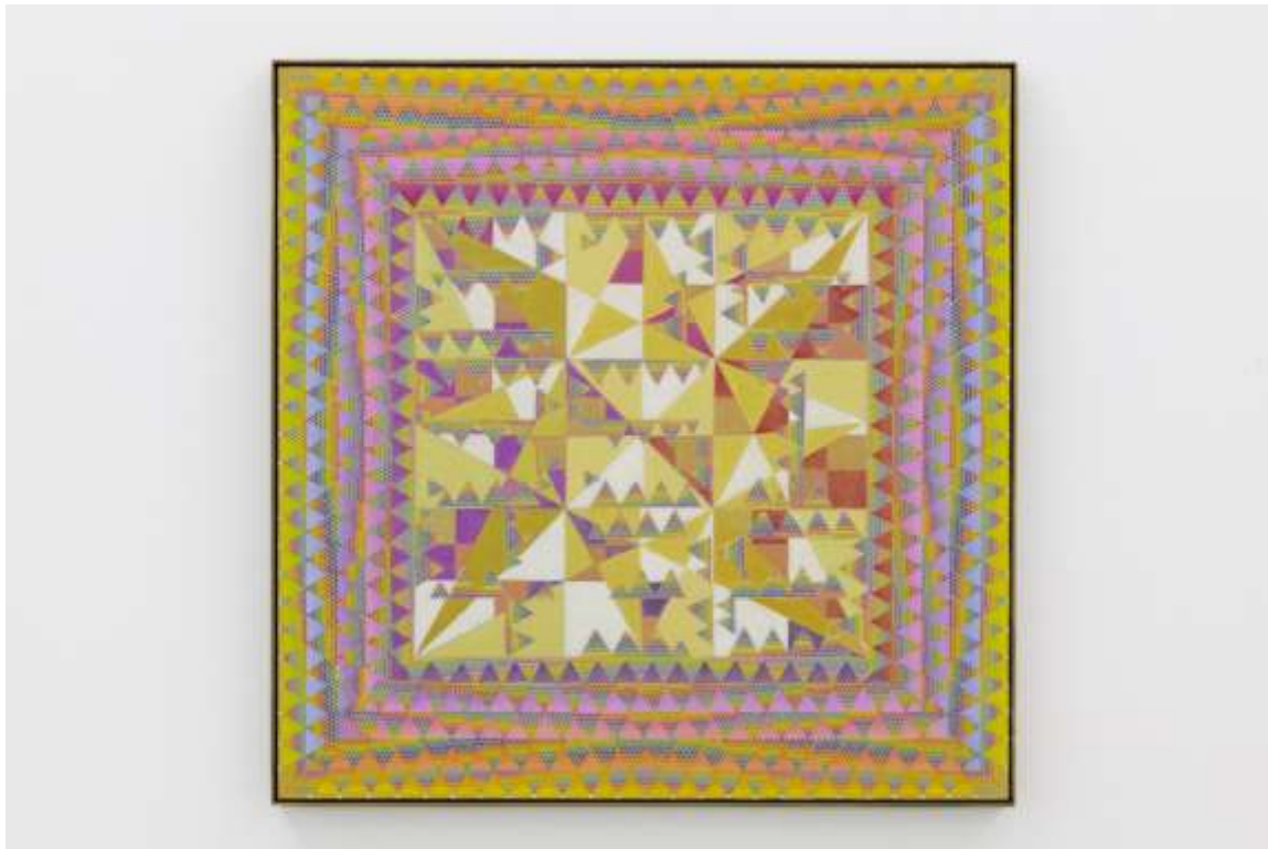
Xylor Jane, “Magic Square for Earthlings,” 2017. Oil and ink on board, 19.75 by 19.75 inches Parrasch Heijnen Gallery

Her third solo show in Los Angeles, “Magic Square for Earthlings,” is a tour de force of delicacy and nuance, its devotion and generosity putting visitors in touch with otherwise invisible patterns and rhythms that structure the cosmos while making us see that we are part of the mystery.