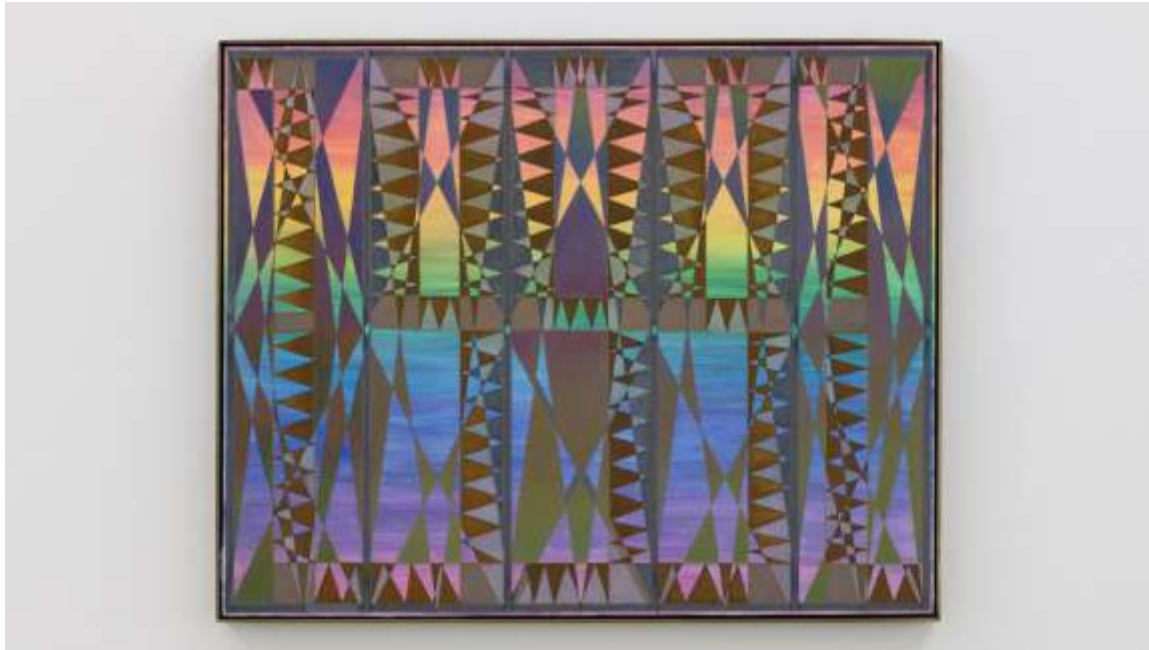
Xylor Jane, "91418," 2017. Oil on board, 16 inches by 20 inches. Parrasch Heijnen Gallery)

See all of our latest arts news and reviews at latimes.com/arts .