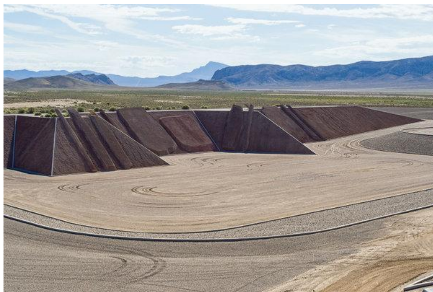
Michael Heizer’s “City” has been a work in progress since the 1970s.

A work of art, then, is never completed so much as it is forever evolving, like a child. And like a child, an artwork requires attention, concern, respect, love — even though (unlike a child), it can’t return these emotions. Certain artists build the concept of a long gestation period into the work itself: “Black Square XVII,” an installation by Taryn Simon at the Garage Museum of Contemporary Art in Moscow, is currently an empty shelf in the museum, reserved for a chunk of vitrified nuclear waste once its radioactive properties have diminished to a level safe for human exposure — about 1,000 years from now, in 3015.