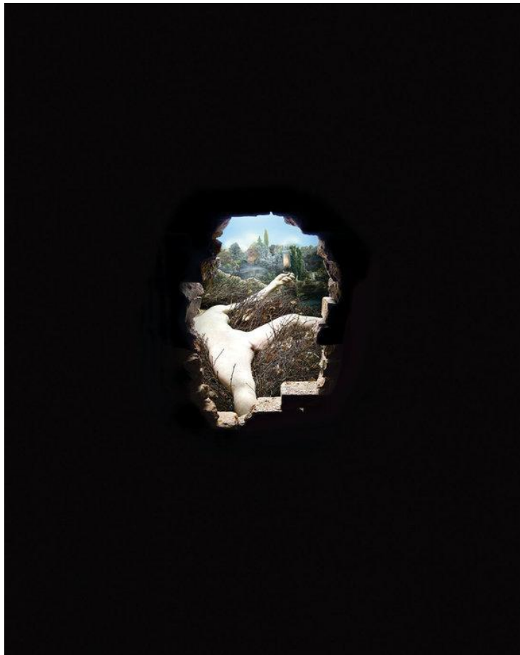
Marcel Duchamp's final piece, "Étant donnés," which he worked on in secret for 20 years.

These kinds of efforts have long been acknowledged as much for the otherworldly patience they require as for their artistry. But in an era of digital hyperdrive, the meticulous, even tedious work that once went into art has been largely replaced by a keystroke, and attention spans have shrunk to virtually nothing. The notion of a contemporary artist pledging fidelity to a single work over decades now seems even more heroic.